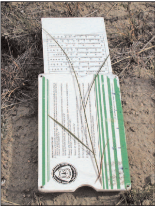
A bluebunch wheatgrass tiller in the 4-leaf stage.

Note: Readiness criteria and GDDs requiring validations are highlighted.