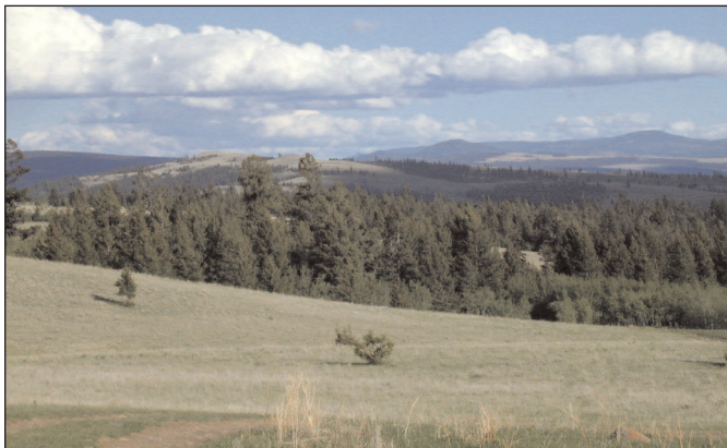
Early spring range in the Central Cariboo.

North Dakota has information on junegrass, needle-and-thread, green needlegrass, western wheatgrass, and crested wheatgrass (Appendix 3).