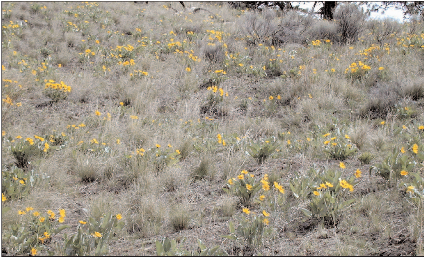
Bluebunch wheatgrass is in the 3.75-leaf-stage and balsam root is 70% in bloom.