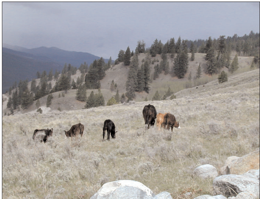
Livestock on early spring range.