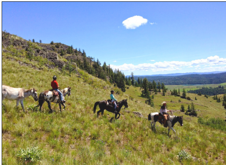
A trail ride on B.C. rangelands

This document provides guidelines and safety tips for the recreational use of horses on rangeland, to help maintain the health and vigour of these areas, minimize conflicts with other users and reduce impacts related to the recreational use of horses.