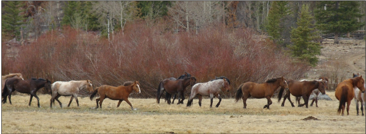
Feral horse herds are common on Crown range.

Safety on the range is specifically addressed in another ministry brochure 4 , but every recreational rider needs to be aware of potential hazards on rangelands. They include animals (wildlife, feral horses, bulls, protective mother cows), vehicle traffic, logging activity, fences (conventional barbed-wire and electric), and standing dead trees — to name just a few.