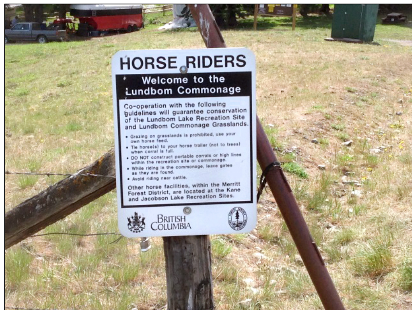
Rules are often posted at recreation sites.

The Ministry of Forests, Lands and Natural Resource Operations operates a network of recreation sites in British Columbia. Detailed information is available at http://www.sitesandtrailsbc.ca/planning-your-trip/