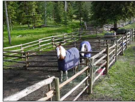
These newly constructed corrals are in use at Lundbom Lake Recreation Site.