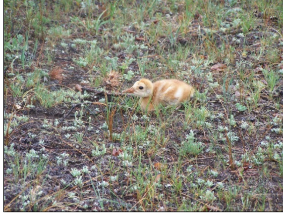
This Sandhill Crane chick was seen in an open meadow surrounded by pine forest.