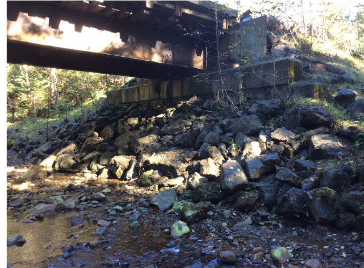
Left Bank Abutment when facing downstream