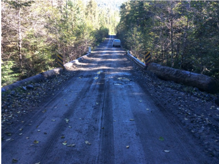
Approach from Right Bank when facing downstream