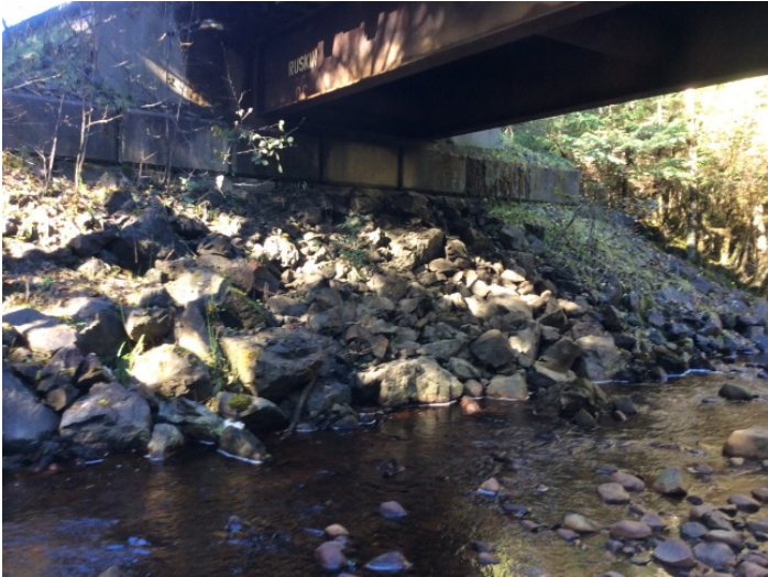
Right Bank Abutment when facing downstream