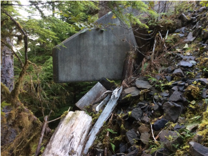
Left Bank Abutment when facing downstream