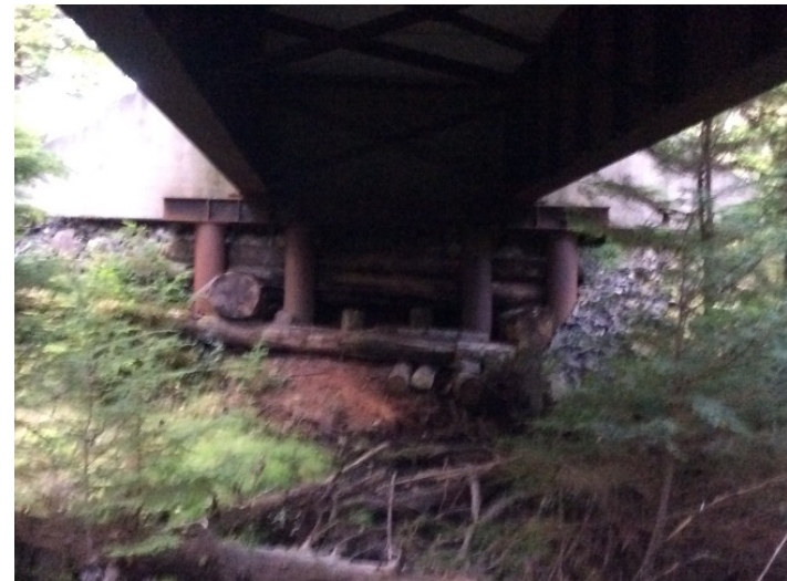
Left Bank Abutment when facing downstream