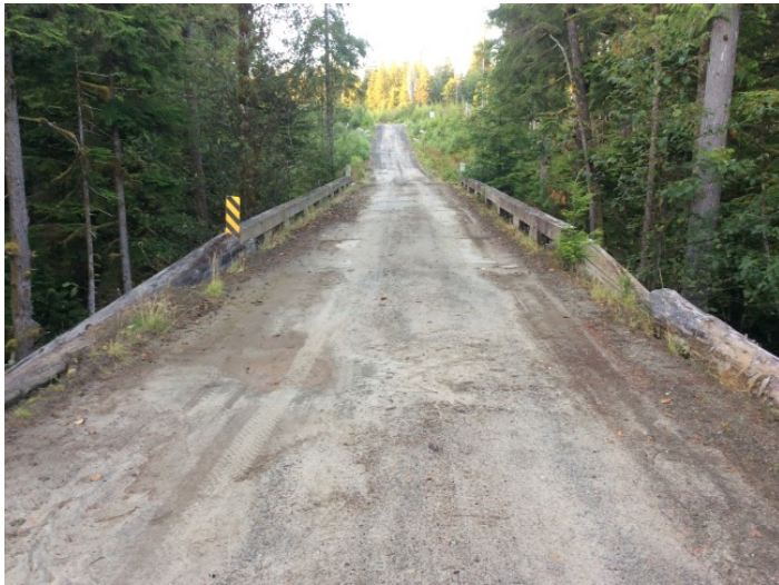
Approach from Right Bank when facing downstream