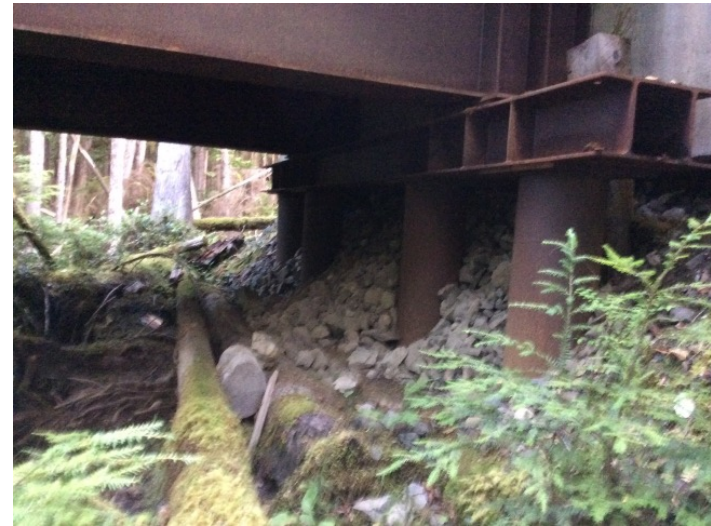
Right Bank Abutment when facing downstream