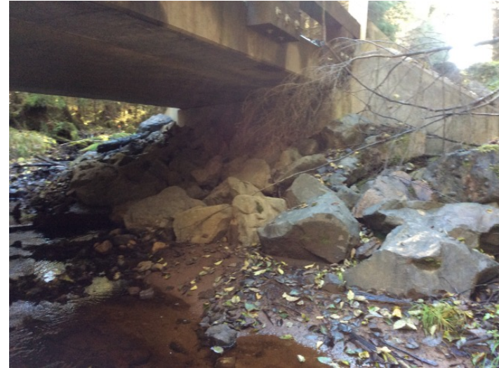
Left Bank Abutment when facing downstream