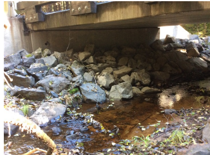
Right Bank Abutment when facing downstream