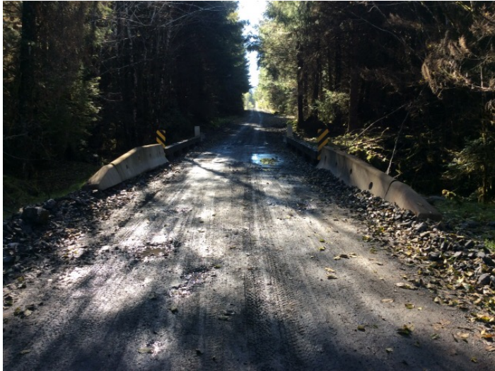
Approach from Right Bank when facing downstream