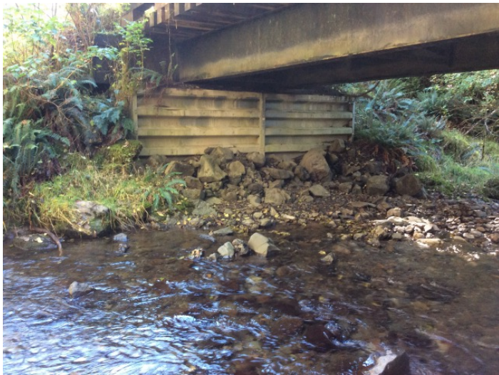
Left Bank Abutment when facing downstream