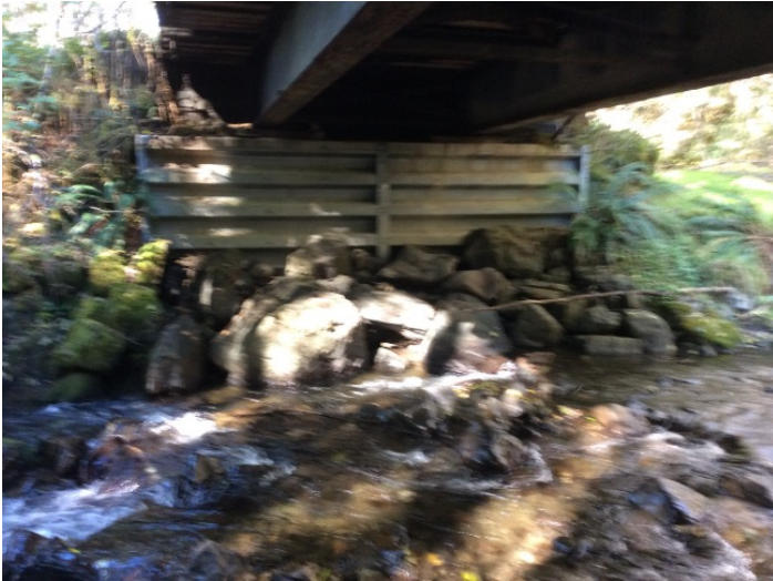
Right Bank Abutment when facing downstream