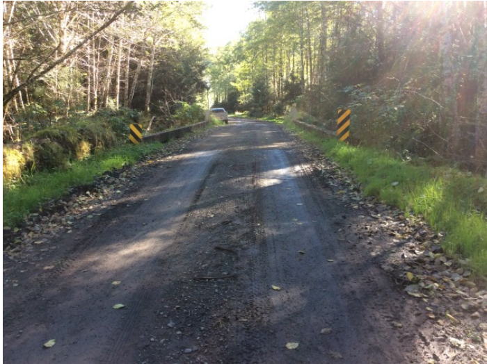
Approach from Right Bank when facing downstream