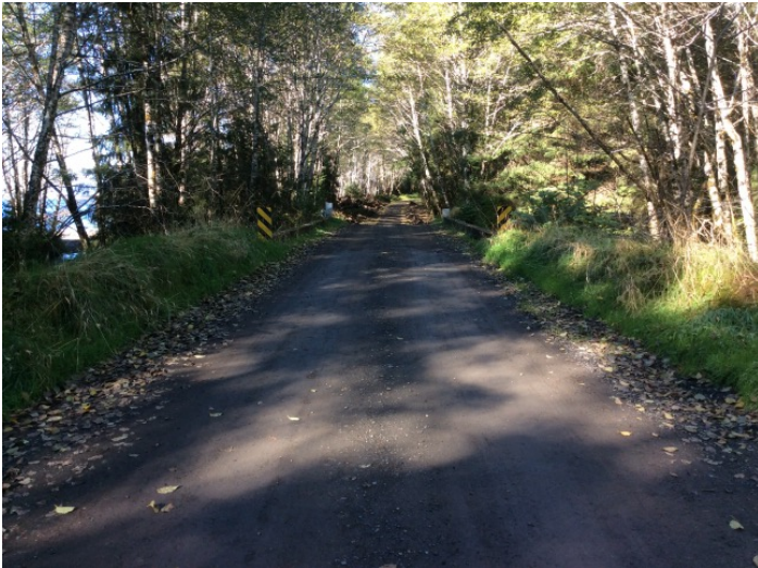
Approach from Left Bank when facing downstream