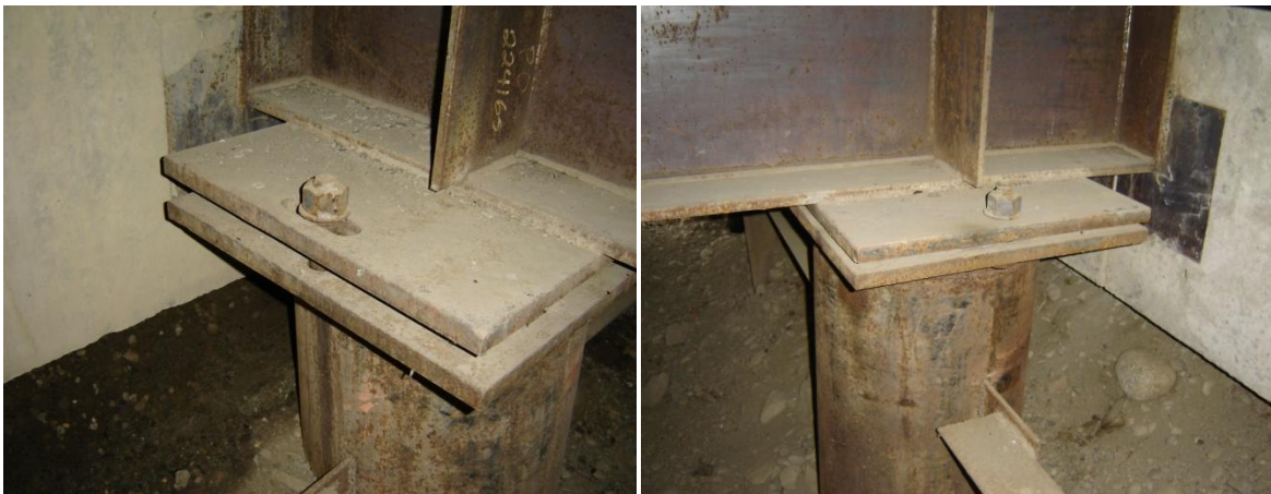
These bearings connect the steel girders to the pile tops using a bolted connection that allows for expansion and contraction at one end of the superstructure.

Longer bridges composed of multiple spans and piers may have fixed bearings on the piers and expansion bearings on the abutments. Differing combinations may be encountered depending on the specific circumstances.