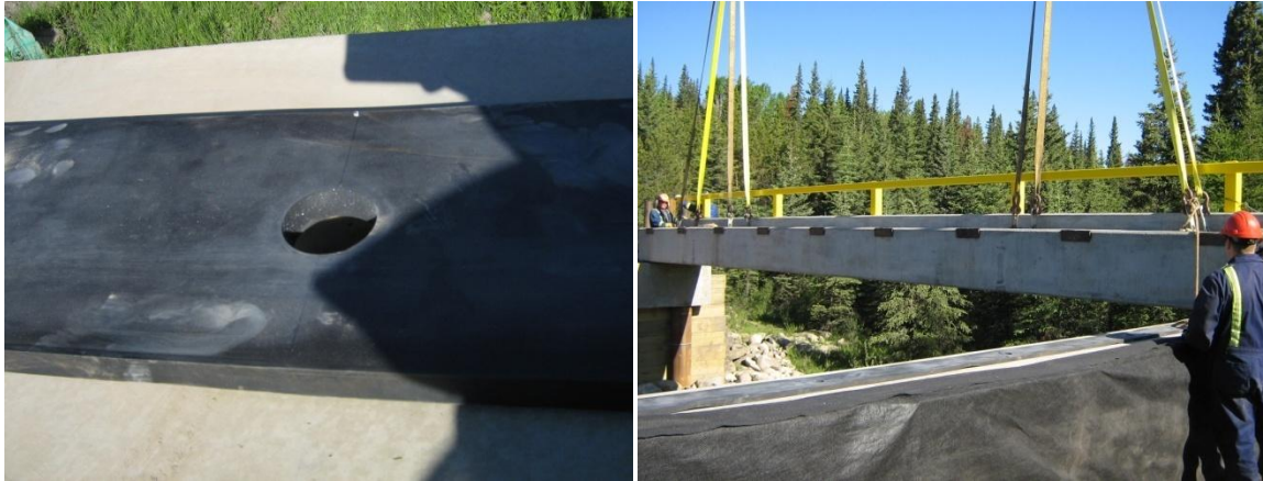
Left concrete cap beam with elastomeric material in place (note hole for dowel). Right, girder being installed.