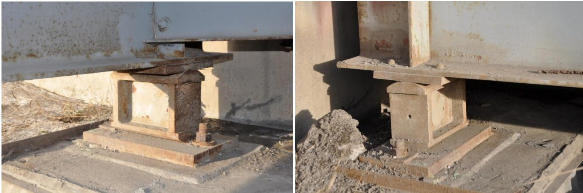
An example of rocker bearings

The following photographs show a typical rocker bearing. These are not commonly found on Forest Road Bridges and are generally restricted to quite large structures.