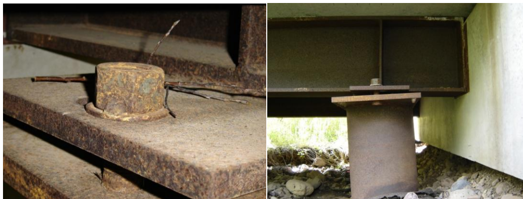
Left: Same bearing, bolt is at the limit of expansion in the expansion slot Right: Overview of the same bearing.

In this case the cause of the problems noted in the preceding 4 images is uneven settlement of one spread footing. The uneven settlement is causing a tilt to the support tower that puts unanticipated loading onto the superstructure through the bearing.