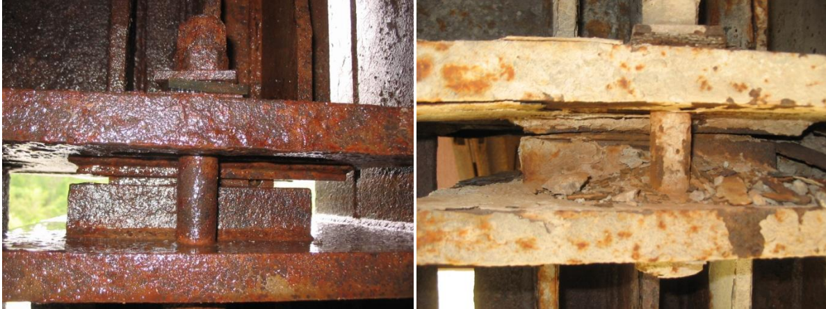
Extreme examples of rusted bearings

Recommendation: Water that is observed to be flowing onto the bridge and contacting the bearings should be diverted away from the structure. If corrosive chemicals are utilized for ice melting during winter applications, consideration should be given to avoiding depositing these materials on the bridges. For those applications subject to salt spray or other corrosive elements in the air, consider selecting different materials for the bearings or protective painting etc.