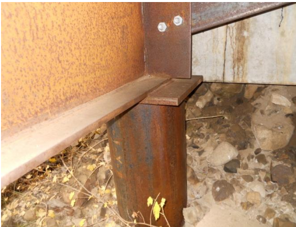
Steel bearing plate welded to girder and pile top.

Although not a typical installation, under some circumstances steel girders may not be provided with formal bearings. Steel girders may be attached directly to the steel pile tops or a cap beams. In this scenario there is no provision for expansion, contraction or rotation. The steel bearing plates are incorporated to spread the loads from the superstructure over a larger area on the foundation. This system for attaching steel girders to their foundations is not encouraged.