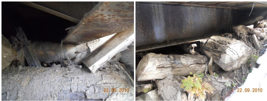
Broken materials under girders caused by using under sized materials or subsequent deterioration

Recommendation: For structures that were improperly installed, the superstructure should be lifted off the foundation and adequate bearing capacity established in the underlying soils. The sills can then be re-positioned and the superstructure should then be properly fastened to the sills prior to being put in service. Consider restricting load sizes until repairs are complete.