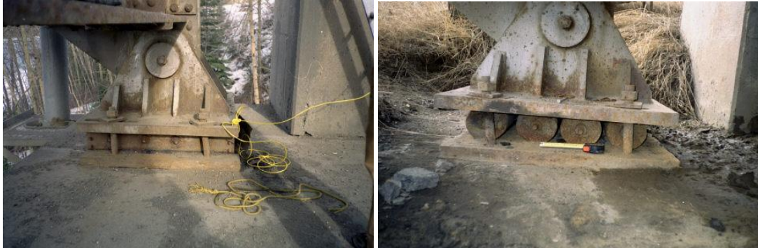
An example of roller bearings

The following photographs show a typical roller bearing. These are not commonly found on Forest Road Bridges and are generally restricted to quite large structures.