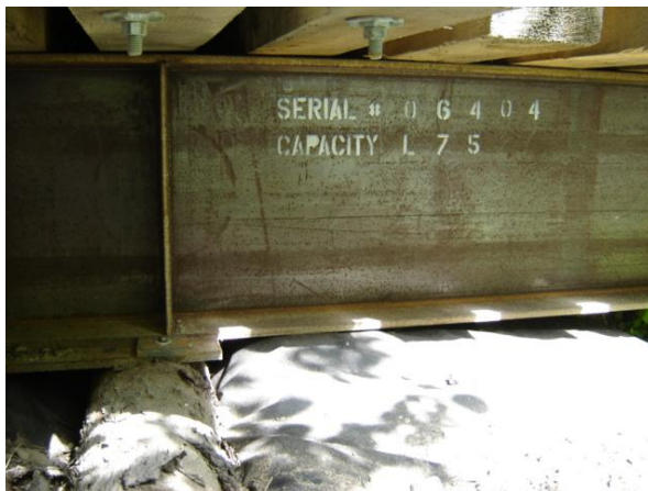
Steel Girders on Log Sill

On temporary bridges, steel girders are often resting on timber foundations. These foundations may be composed of logs or squared timbers either as single sills, caps, cribs or bin-wall construction. The timbers may be either untreated, painted or pressure treated materials. Steel Plates welded to the underside of the girders help to spread the anticipated loads over a larger area of the foundation timbers. (See standard Drawing #STD-E-050-32 for typical installation)