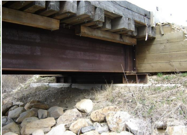
Steel Girders on Steel Cap & Lock Blocks