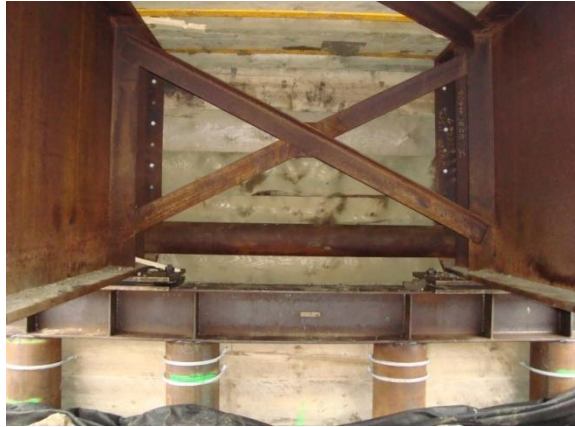
Stiffeners in cap aligned with girders and piles.