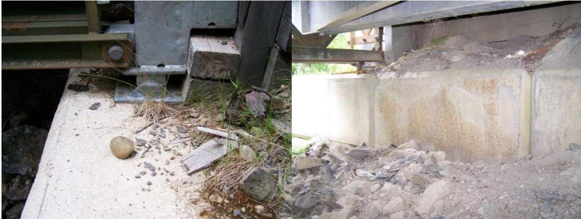
Examples of Panel Bridge Bearings

The following photographs show typical Acrow and Baily Panel Bridge type bearings