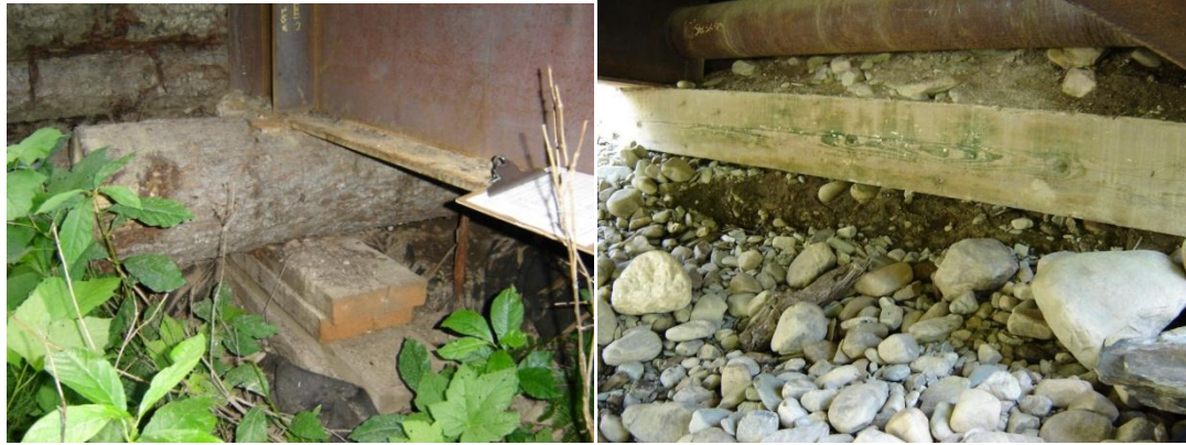
Voids under foundations caused by settlement or erosion (those blocks are insufficient)