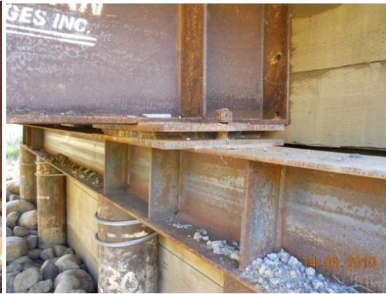
Stiffener in Girder aligned with Cap

Recommendation: Minor mis-alignment of stiffeners with their adjacent components may not constitute a serious defect. Bent or deformed flanges, webs or stiffeners can be symptoms of a very serious defect that if not addressed may result in failure of the structure. In this case measurements of the amount of mis-alignment or deformation are to be taken and the issue referred to a qualified professional for advice and recommendations.