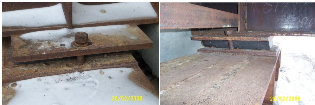
The bolts securing these bearings to the foundation have been sheared off.

The bolts connecting the upper and lower bearing plates may become bent or in more severe occurrences may shear off entirely.