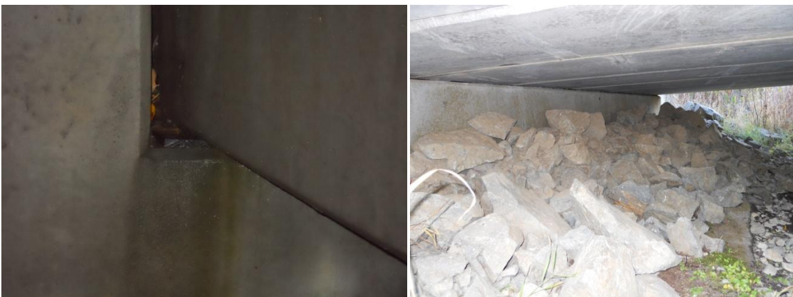
Side view of Concrete Deck Slabs in place on concrete abutment and view under bridge.