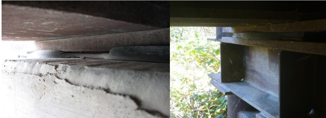
Examples of crushing (bulging) of the elastomeric pad is evident in these two images

Cause: Deformation of the Elastomeric Pad may have 3 causes. 1.) The strength of the original pad may have been underspecified or incorrect material supplied for construction. 2.) The pads may be subject to loading that was not anticipated during design. 3.) The anchor bolts may have been over tightened not allowing for the clearance as specified on the design drawings.