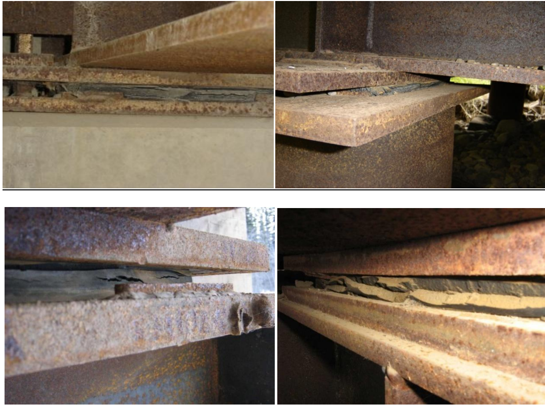
Examples of physical deterioration of elastomeric pads.

The elastomeric bearing pads in the following images show signs of cracking and are losing their flexibility.