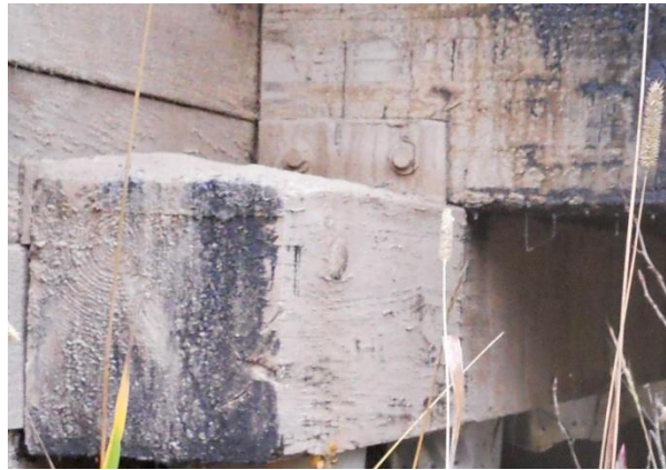
This bracket secures the timber stringer to the pile cap and prevents movement

Bearings used in timber bridge construction typically consist of steel plate formed into a bracket. The bracket is attached to the timber stringer and timber cap by means of bolts or lag screws.