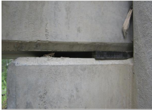
Elastomeric Bearing Strip visible at end of precast abutment cap beam