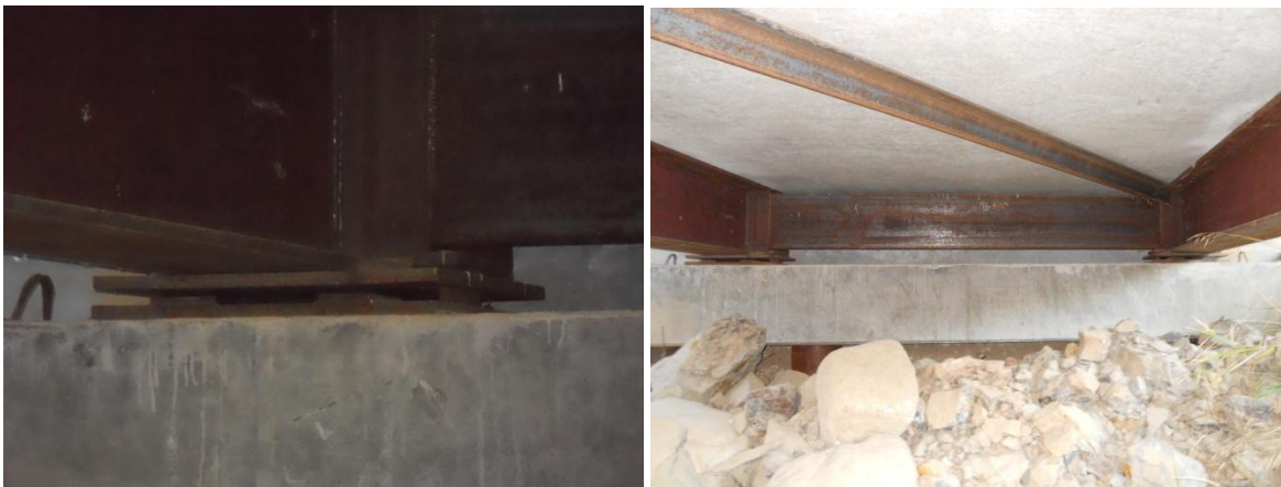
These bearings connect steel girders to a concrete cap beam