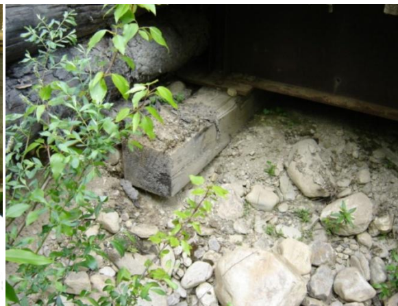
Steel Girders on Sawn Timber Sill