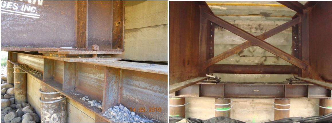
These bearings connect steel girders to a steel pile cap beam