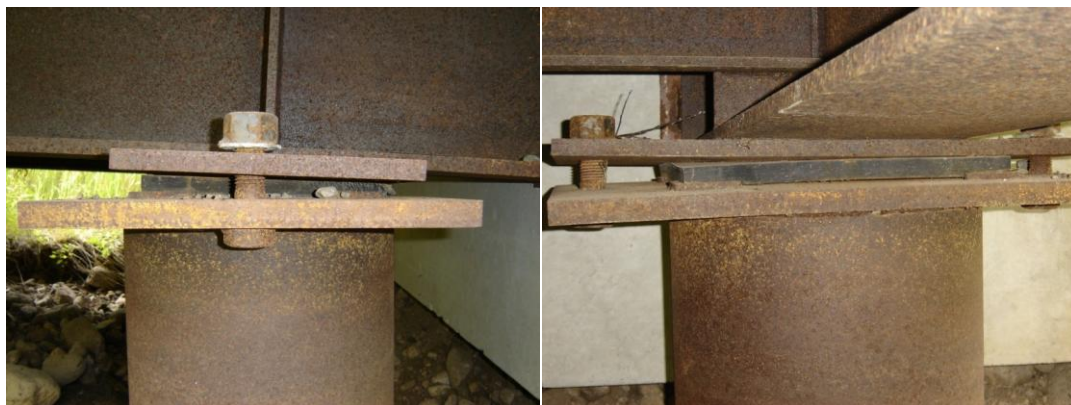
Left: Side view of bearing, plates are not parallel causing crushing at the abutment end of the pad. Right: Same bearing, viewed from under the bridge, note gap on the face and left side.