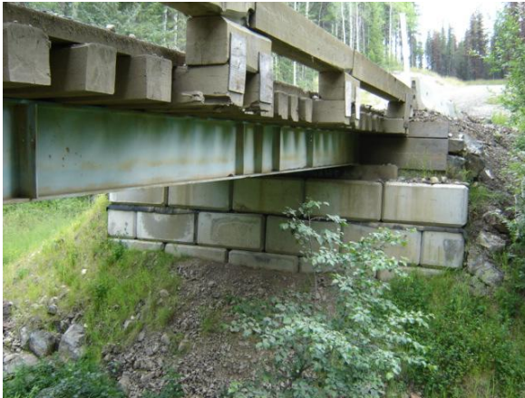
Steel Girders on Timber Sill & Lock Blocks

Another foundation system in common use consists of steel girders resting on a concrete lock block foundation. Typically there should be a timber, steel or concrete (not shown) cap between the girders and the blocks to spread the loads from each girder to more than one block. The steel or timber cap must be of sufficient strength to spread the anticipated loads across all the supporting blocks. There may be more than one layer or tier of vertically stacked blocks in the foundation. (See standard Drawings # STD-E-050-30, 31 & 32)