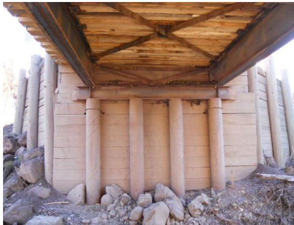
Steel girders bolted to pile cap beam