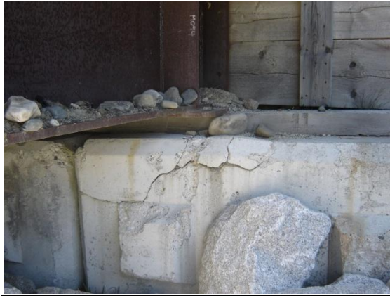
Fractured lock block.

Recommendation: All lock block foundations require an adequately sized and properly fastened cap beam for the girders to bear on. The soils underneath the lock blocks must be properly compacted during installation to ensure uneven settlement does not occur. If uneven settlement has occurred, repairs are required to be undertaken to address the settlement and may entail the entire structure being removed and a proper base prepared for the lock blocks to bear on. If settlement has not occurred, consideration should be made for designing and installing an appropriately designed cap beam. Fractured or broken blocks should be replaced or otherwise repaired as directed by an engineer.