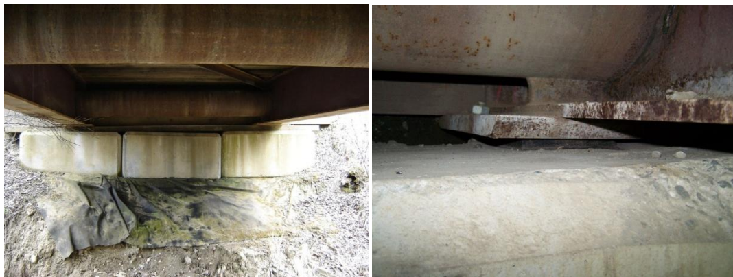
Left: Inadequate cap does not bear on center block. Right: No cap, only 1 block carries entire load

Implication: The significance of this problem is dependent on the bearing capacity of the underlying soils and the quality of materials and quality of installation of the lock blocks. If there is insufficient bearing capacity in the soils, the forces being transferred through a single lock block may be larger than the soil's capacity to resist and result in uneven settlement of the structure. The blocks themselves may fracture under heavy loads. This can eventually lead to racking or twisting of the superstructure and ultimately structural failure.