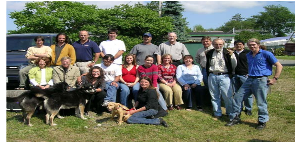
Some of the Community Planning Forum members for the Haida Gwaii/QCI Land Use Plan meeting in Port Clements