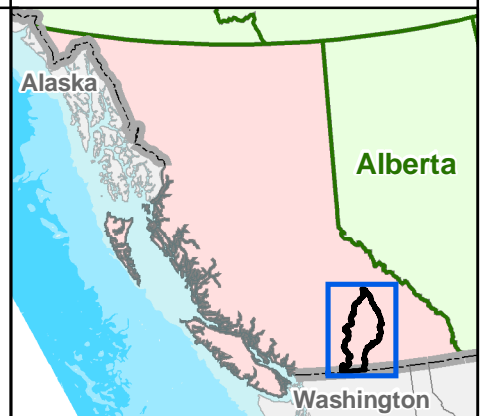
Key Map of British Columbia

Prepared For Ministry of Agriculture and Lands Integrated Land Management Bureau Regional Client Service Division