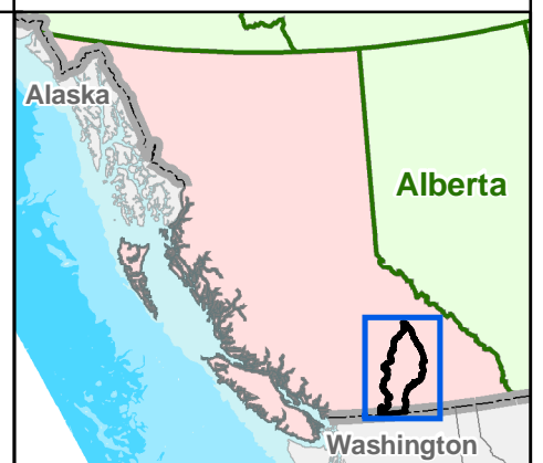
Key Map of British Columbia

Prepared For Ministry of Agriculture and Lands Integrated Land Management Bureau Regional Client Service Division