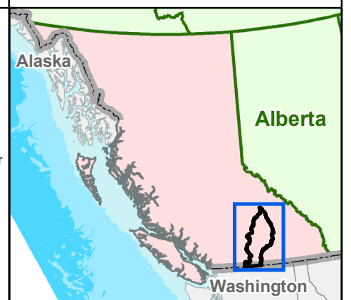
Key Map of British Columbia

Prepared For Ministry of Agriculture and Lands Integrated Land Management Bureau Regional Client Services Division