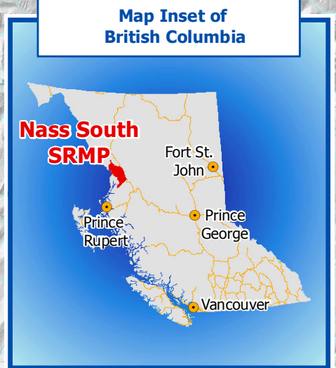
Map Inset of British Columbia