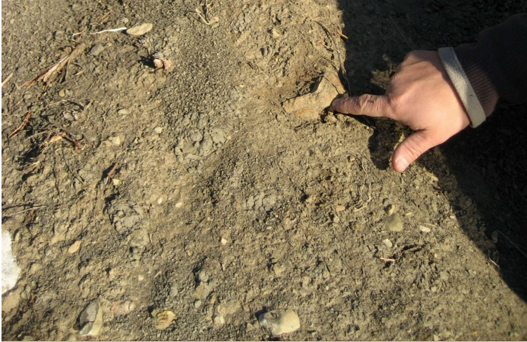
Partially exposed dinosaur bone