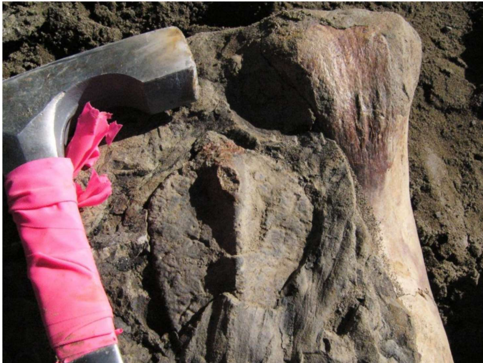
Dinosaur bone (Theropod) and bony scute (Ankylosaur)

Dinosaur and Reptile Bones: While British Columbia has numerous trackway sites, sites with dinosaur bone remain rare. These are extremely important fossil sites as little is known about Cretaceous dinosaur species in British Columbia. Discoveries of marine reptiles are also rare.