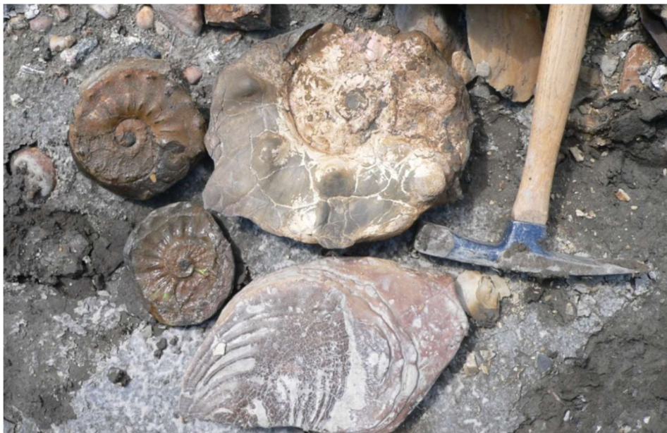
Cretaceous ammonites and bivalves

Shell Beds and Invertebrate Fossils: Well-preserved shells can provide valuable information about species diversity and distributions. Paleozoic rocks contain a variety of invertebrate body fossils such as corals, trilobites, nautiloids, brachiopods and others. Ammonoids and bivalves are common in Mesozoic rocks and can also occur in Paleozoic rocks. While some shells are common, a resource specialist is needed to evaluate the site and determine the significance of the fossils and the deposit. Shell beds potentially preserve vertebrate material such as dinosaur teeth and rare early mammal material.