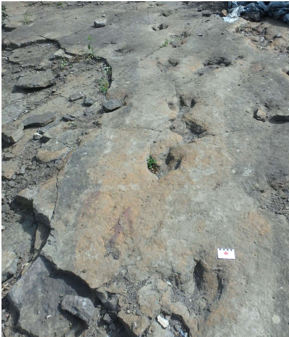
Dinosaur trackways near Hudson's Hope

Dinosaur Trackways: Preserved impressions or casts of dinosaur footprints on bedding planes are extremely important fossil sites. These trace fossils are used to analyze behavior such as herding patterns and how fast a dinosaur could move.