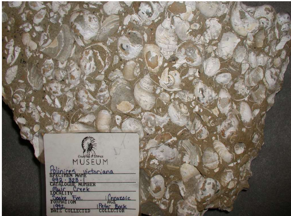
Example of a shell bed, Courtenay and District Museum