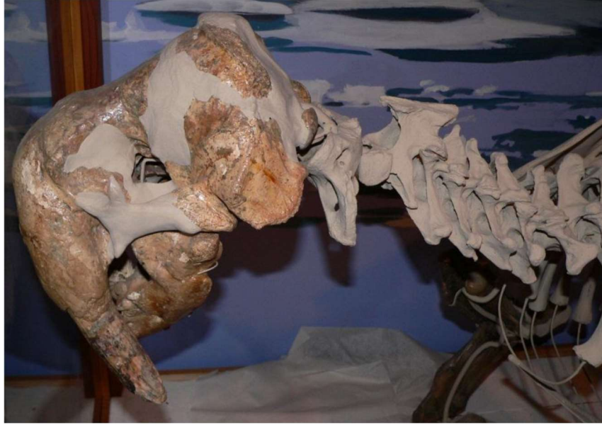
Pleistocene walrus (60,000 years old), Qualicum Beach Museum