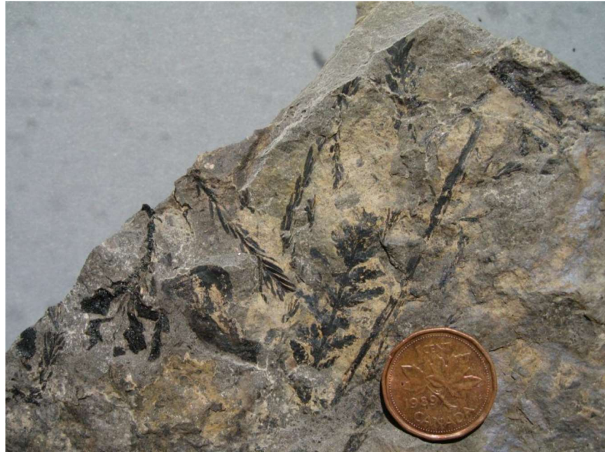
Plant fossils (Taxodiaceae leaves and cones)