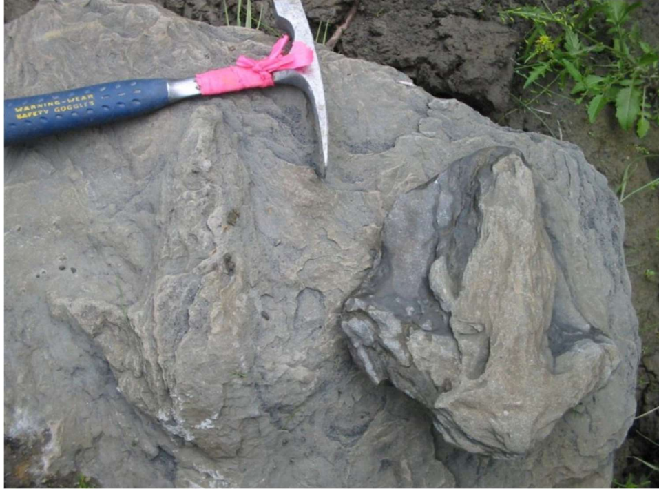
Casts of dinosaur (Ornithomimid) tracks

Dinosaur and Reptile Bones: While British Columbia has numerous trackway sites, sites with dinosaur bone remain rare. These are extremely important fossil sites as little is known about Cretaceous dinosaur species in British Columbia. Discoveries of marine reptiles are also rare.