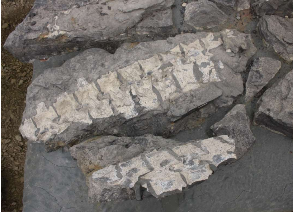
Marine reptile bone (mosasaur), photo about 1 metre wide for scale

Other Bones and Fossils: Although it is difficult for a non-specialist to identify what type of bone has been found, more than just dinosaur bones could be unearthed by project construction. Quaternary (ice age) remains from mammoths, bison, horses, camels and other mammals may be found within a project area. In B.C.'s coastal region, bones from sea mammals may be found buried far inland when the seas flooded the land at the end of the last glaciation. Bones of fossil fish occur in bedrock of many ages, as old as the Paleozoic Era, and mammal bones can be found in bedrock of the Cenozoic Era. These remains are all important fossils.