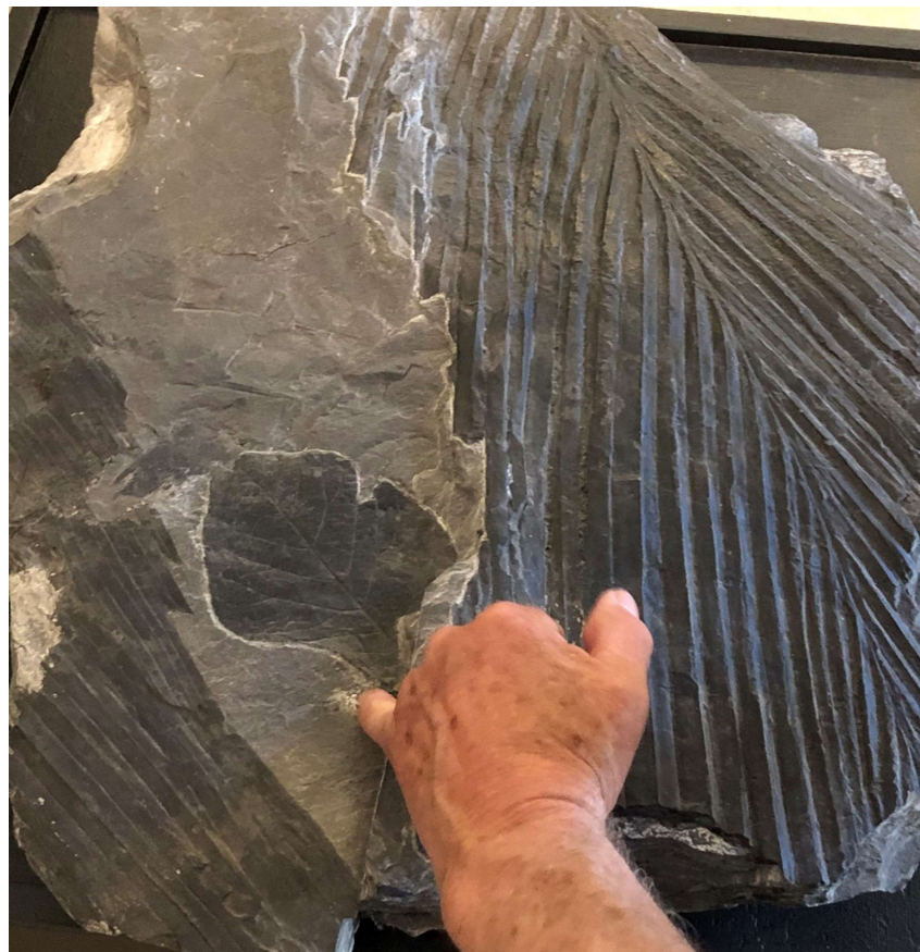
Impressions of plant leaf and palm frond, Qualicum Beach Museum