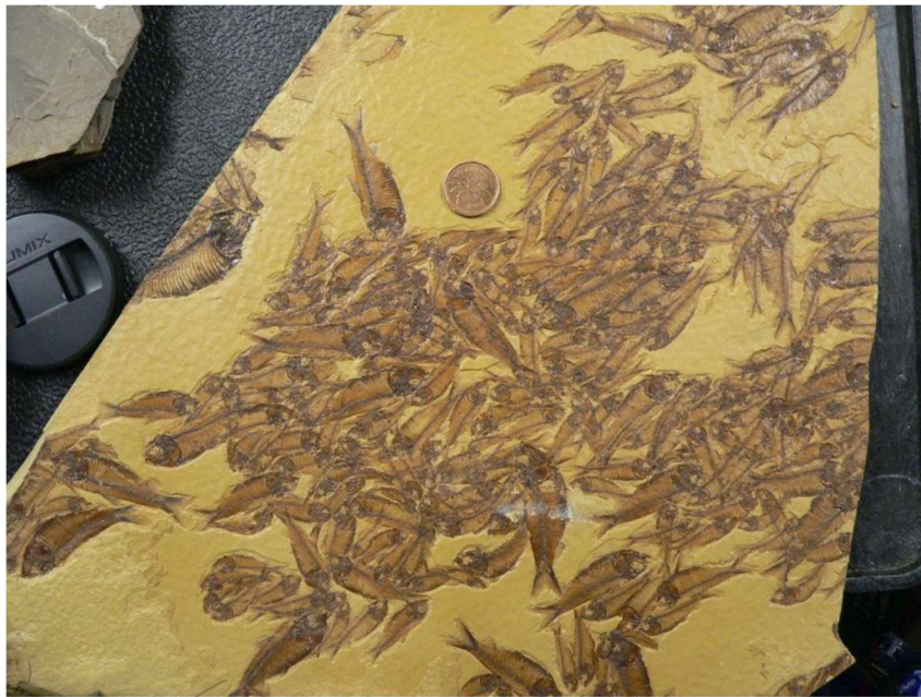
Fish death assemblage, Qualicum Beach Museum

Plant Fossils: Plants are commonly preserved where coal is found. Coal itself is fossilized plant material, although it is typically massive and individual fossils cannot be recognized. Where a coal layer meets a siltstone or sandstone layer, impressions of leaves, cones and flowers may occur. Plants provide valuable information about the past environment, plant communities and climate change. Significant fossil plant sites can occur in bedrock, Tertiary lake deposits and in Quaternary (surficial) deposits. Fossil plant sites can often contain remains of fish, insects and other invertebrates. It is important to report any occurrences of fossil plant remains to be evaluated by a resource specialist.