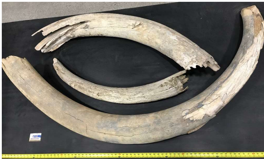
Mammoth tusks, measuring tape for scale is 1.8 metres.

Other Bones and Fossils: Although it is difficult for a non-specialist to identify what type of bone has been found, more than just dinosaur bones could be unearthed by project construction. Quaternary (ice age) remains from mammoths, bison, horses, camels and other mammals may be found within a project area. In B.C.'s coastal region, bones from sea mammals may be found buried far inland when the seas flooded the land at the end of the last glaciation. Bones of fossil fish occur in bedrock of many ages, as old as the Paleozoic Era, and mammal bones can be found in bedrock of the Cenozoic Era. These remains are all important fossils.