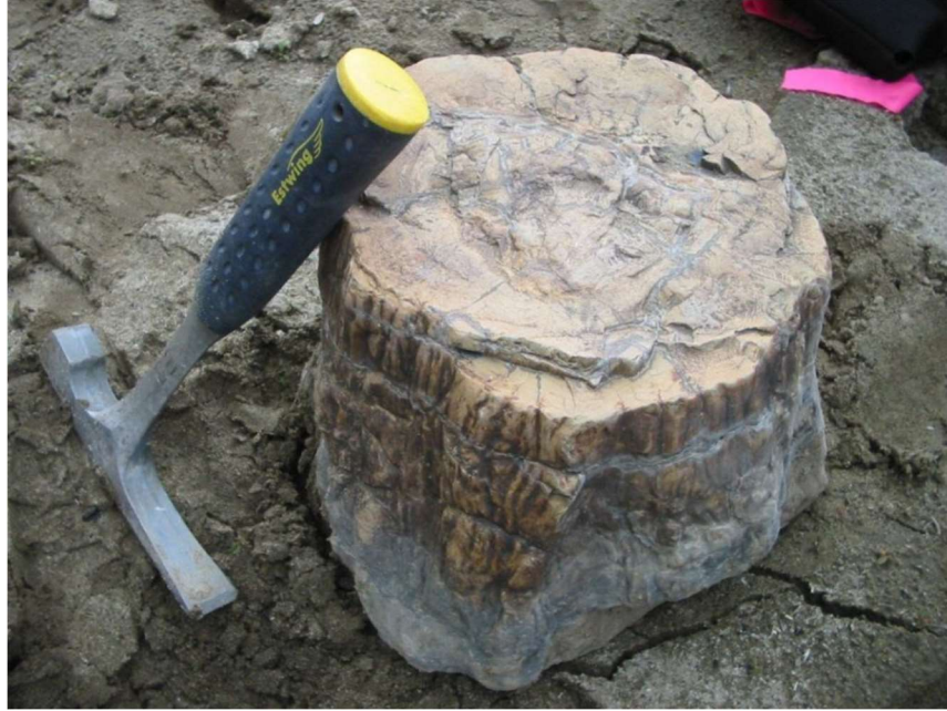
Petrified tree stump

Shell Beds and Invertebrate Fossils: Well-preserved shells can provide valuable information about species diversity and distributions. Paleozoic rocks contain a variety of invertebrate body fossils such as corals, trilobites, nautiloids, brachiopods and others. Ammonoids and bivalves are common in Mesozoic rocks and can also occur in Paleozoic rocks. While some shells are common, a resource specialist is needed to evaluate the site and determine the significance of the fossils and the deposit. Shell beds potentially preserve vertebrate material such as dinosaur teeth and rare early mammal material.