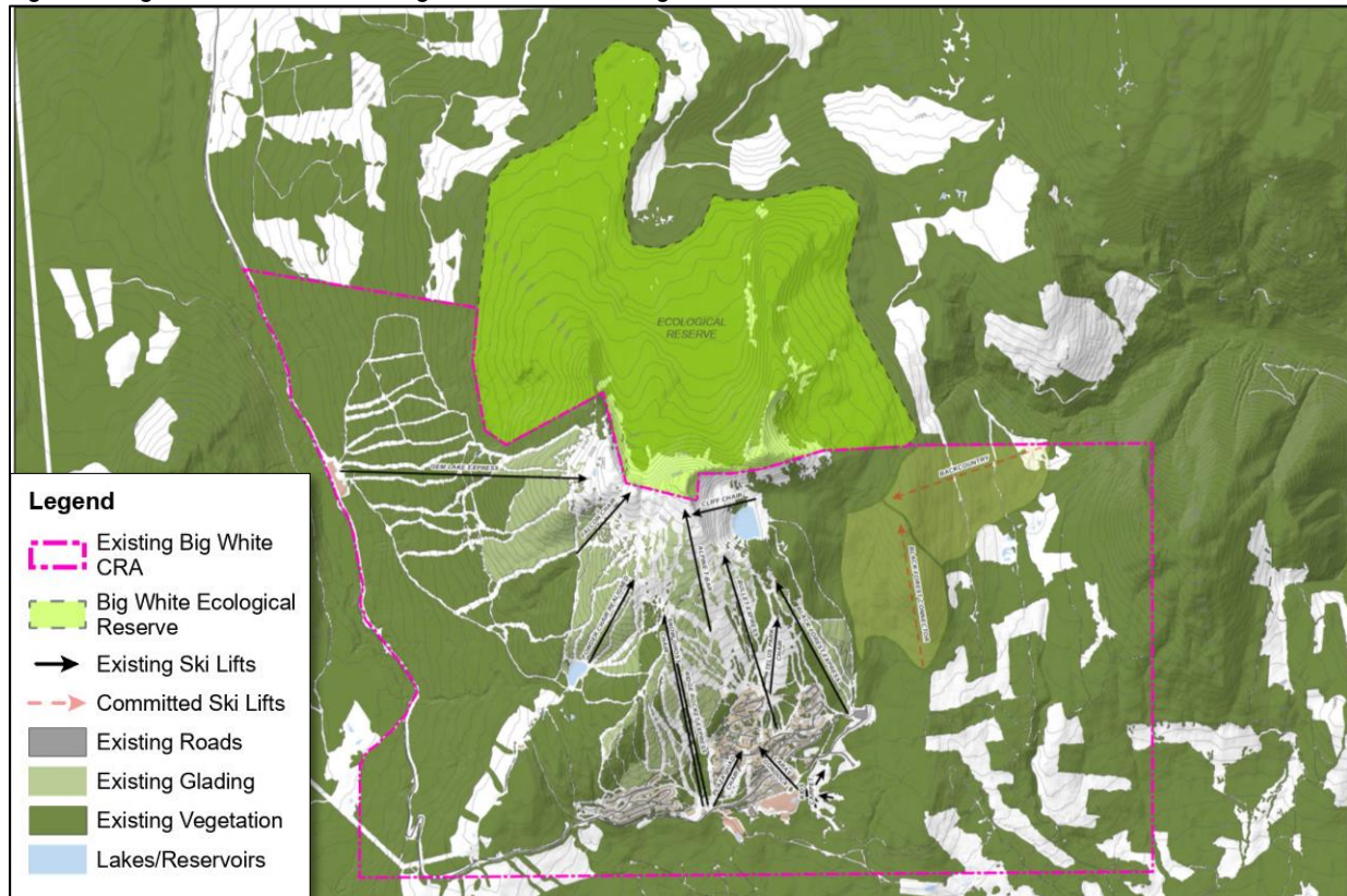
Figure 1. Big White Mountain Ecological Reserve and Big White Ski Resort