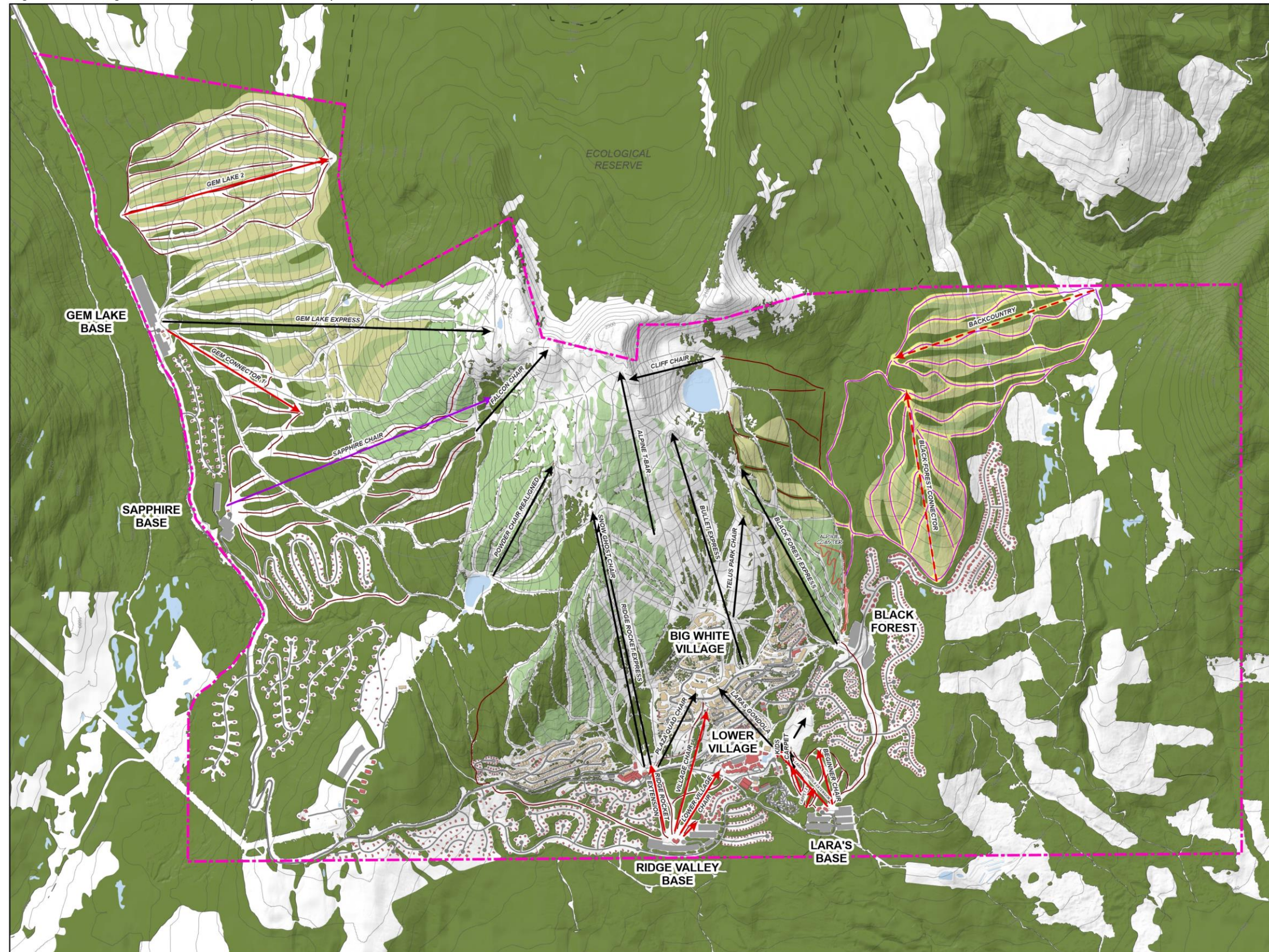
Figure 2. 2026 Big White Ski Resort Proposed Concept