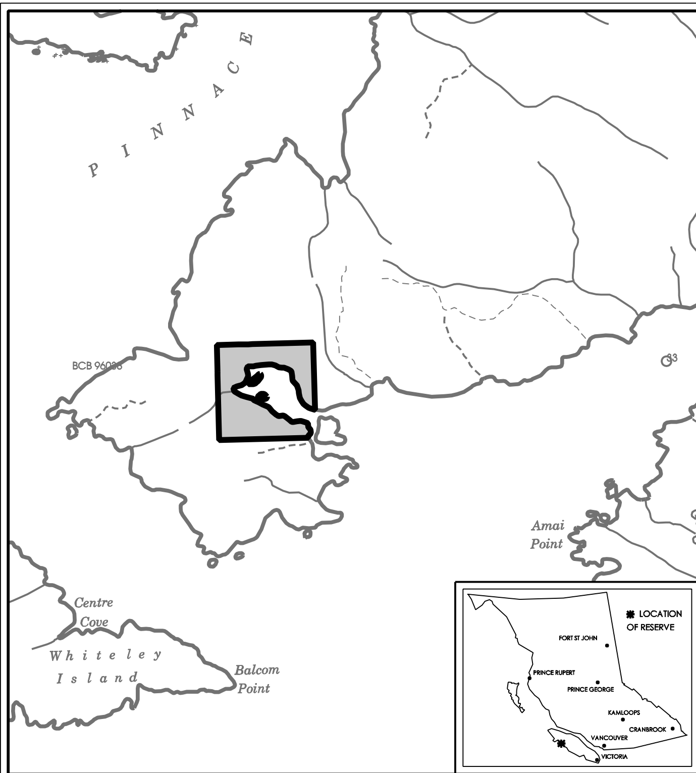
This is a summary sketch of the area shown in the Mineral Titles Online spatial database