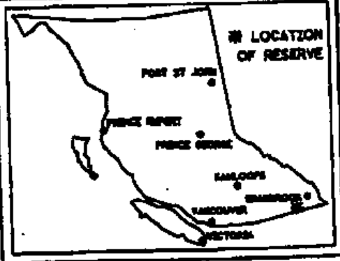
This is a survey sketch of the area shown in black on Mineral Titles Reference Maps (File 1200 0)