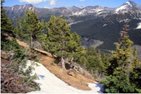
Whitebark pine is typically found in the MH and ESSF parklands such as this one in the coast-interior ecotone