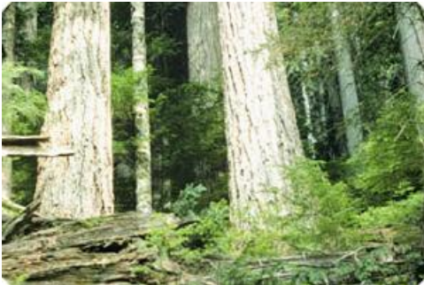
An old cohort of common douglas on a moist, rich site in the CWH zone in Coquitlam River valley