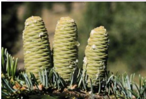
Full size green, immature cones of grand fir in mid-summer