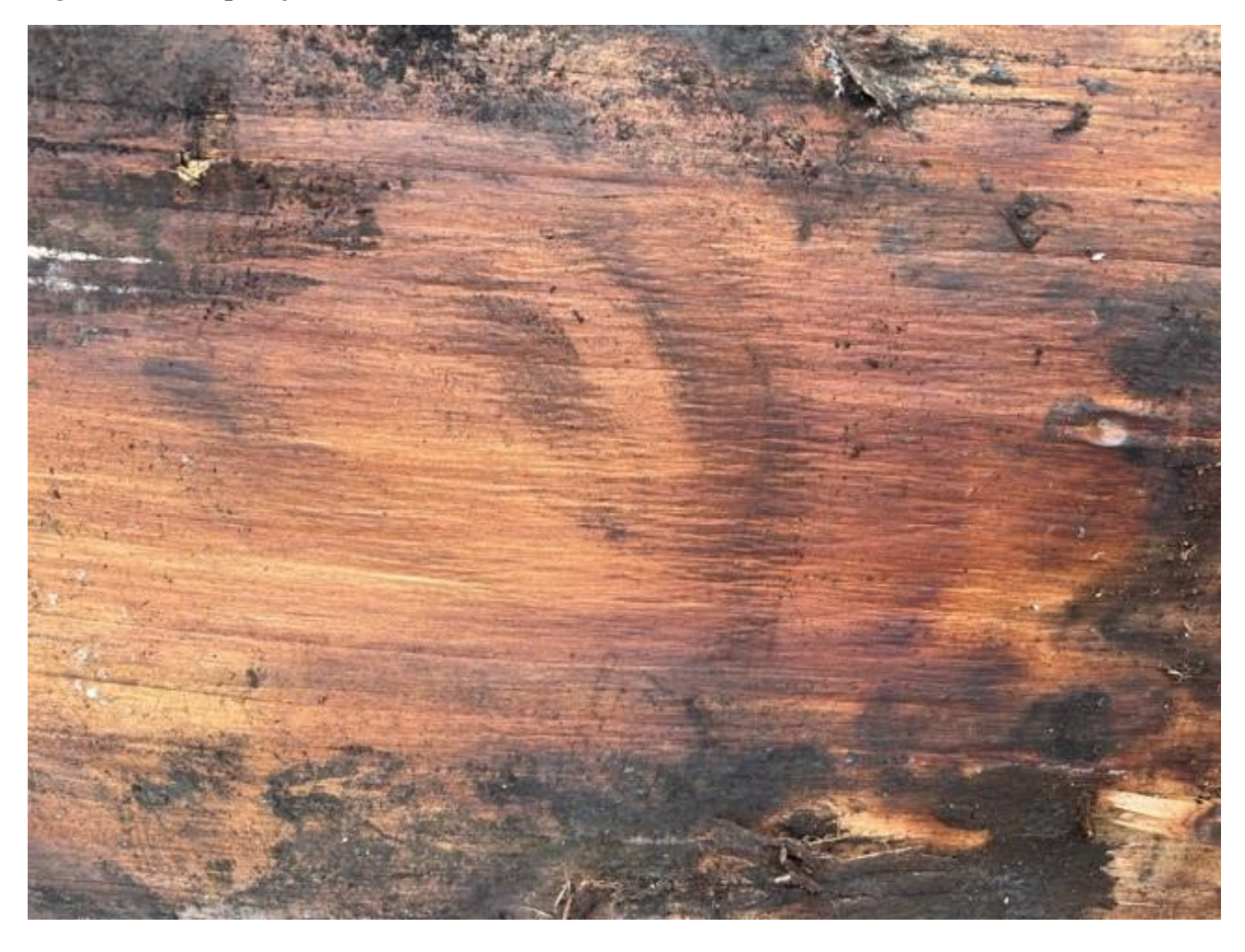
Figure 14 Example of Scorched Wood