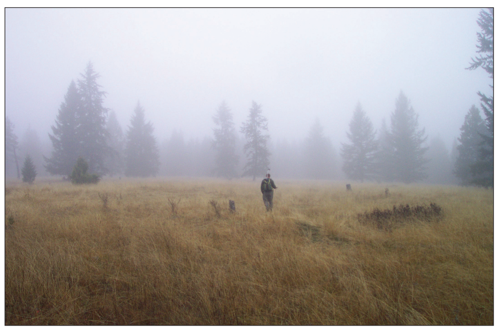
Badger wildlife habitat