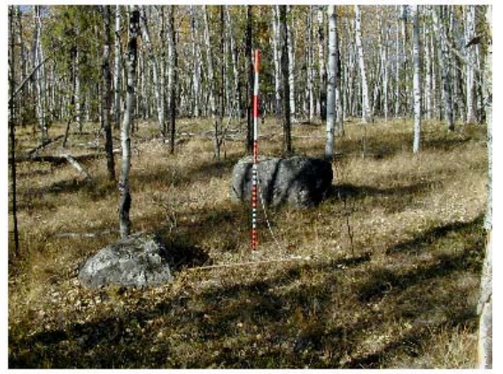
Lightly grazed open forest