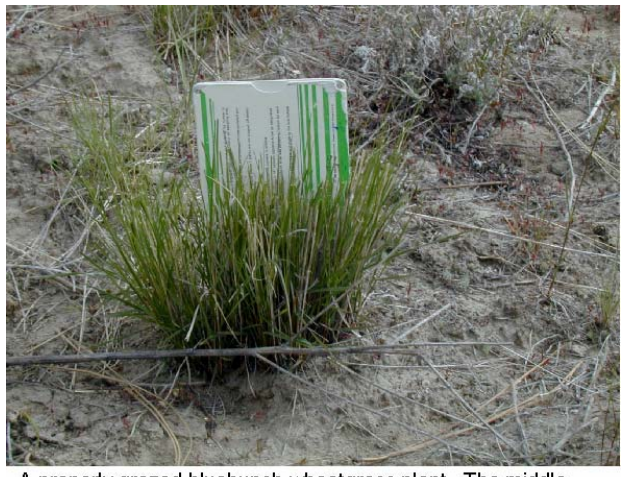
A properly grazed bluebunch wheatgrass plant. The middle portion of the plant has been grazed to about 13 cm, while the outer tillers are about 22 cm long.