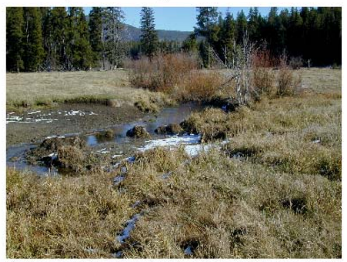
Stream and riparian area damaged by livestock use.