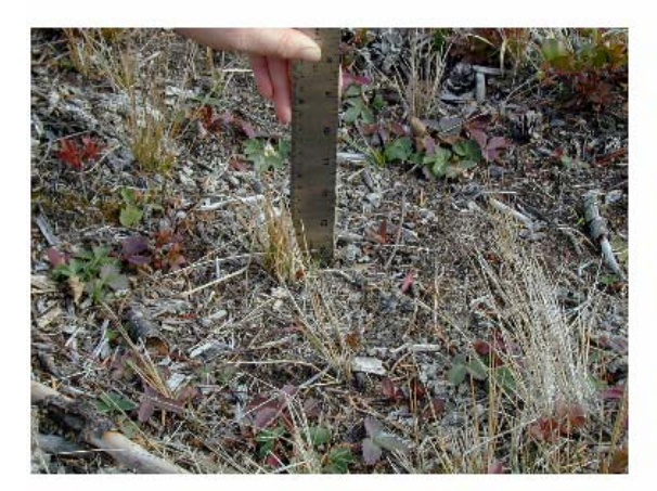
Over-utilized pinegrass with average stubble height of 5 cm