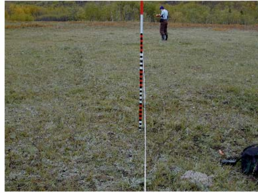
An early-seral grassland community with poor cover