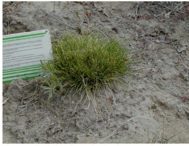
An over-utilized Idaho fescue that has been grazed to about 6 cm in height. Proper use is 15 cm.