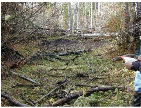
Heavily grazed riparian area