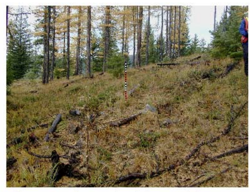
A managed open larch forest with a healthy understorey