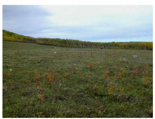
A low vigour creeping red fescue seeding.