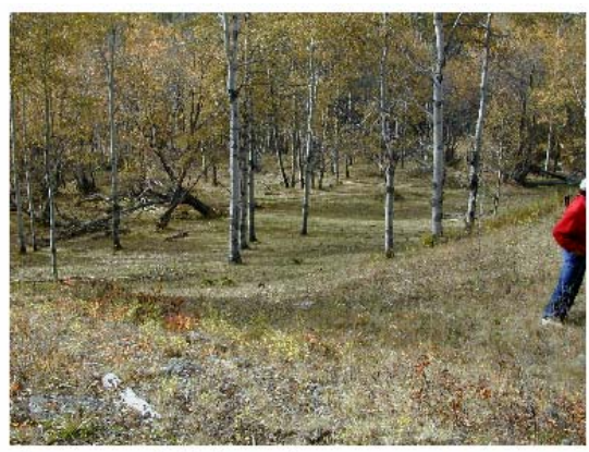
Open south-facing slope