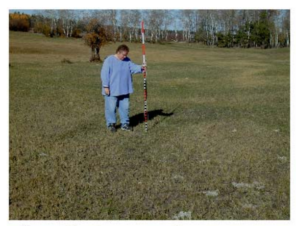
Over-utilized open meadow