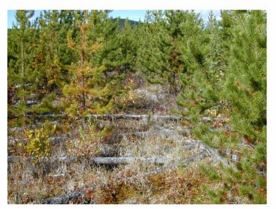
Lightly grazed plantation