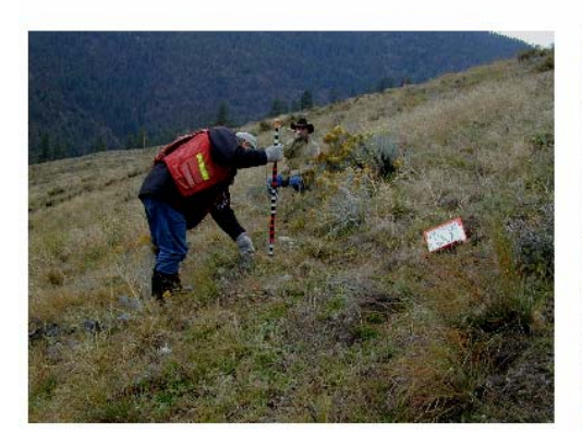
Lightly used bunchgrass community