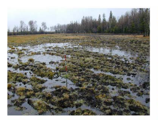
ATV damage to sedge meadow