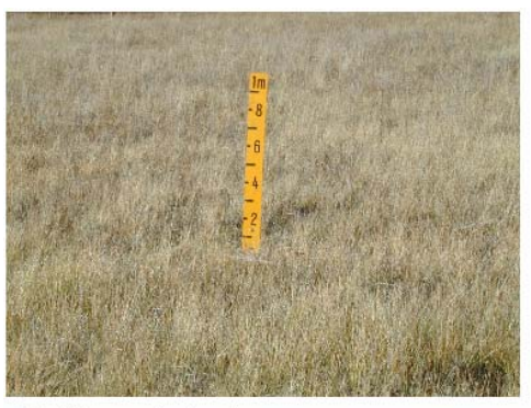
Lightly used wheatgrass