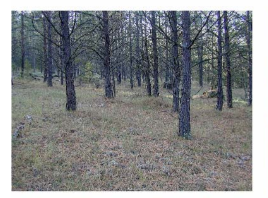
A spaced ponderosa pine stand with a healthy grass understorey