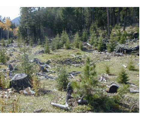
Heavily grazed plantation