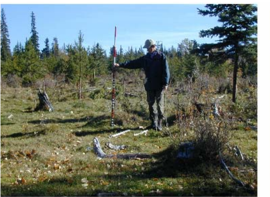
Heavily grazed plantation