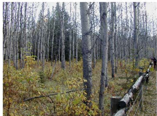
A grazing exclosure