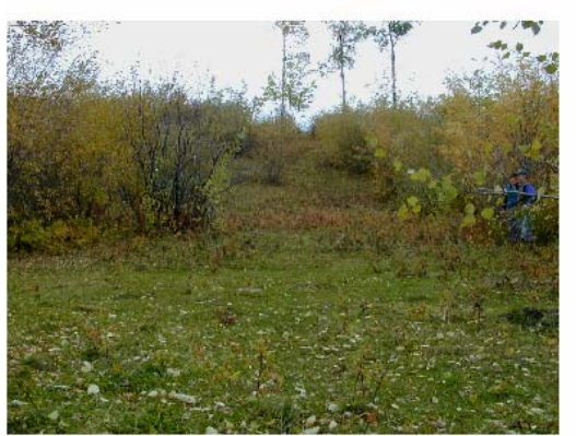
This plant community has been burned and grazed