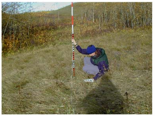
A late-seral grassland-shrub community