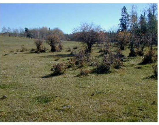
Livestock use has altered the plant community