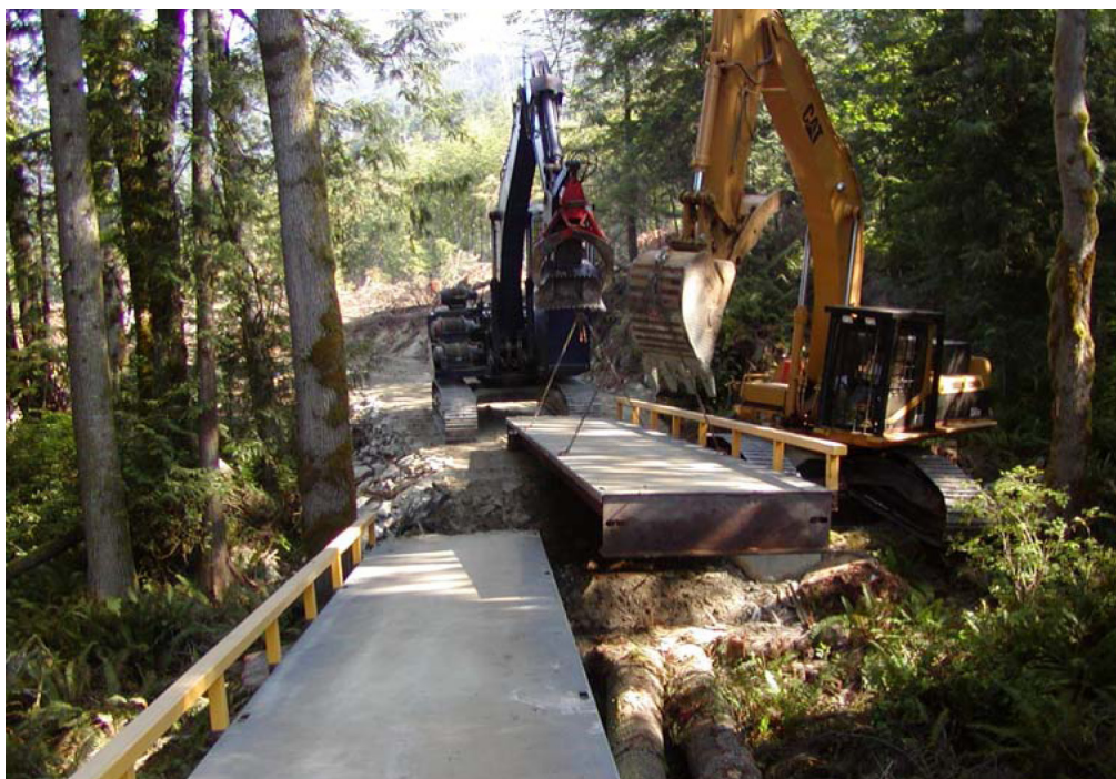
Carefully designed and installed stream crossings result in low erosion potential.

The water quality effectiveness evaluation was developed to quantify the potential effect of forest- and range-related disturbances on water quality and how those impacts might be mitigated. The evaluation is designed so that a non-specialist can quickly estimate, within an order of magnitude for a site, all potential factors contributing fine sediment to a water body and to prioritize that estimate into a "Very Low," "Low," "Moderate," "High," or "Very