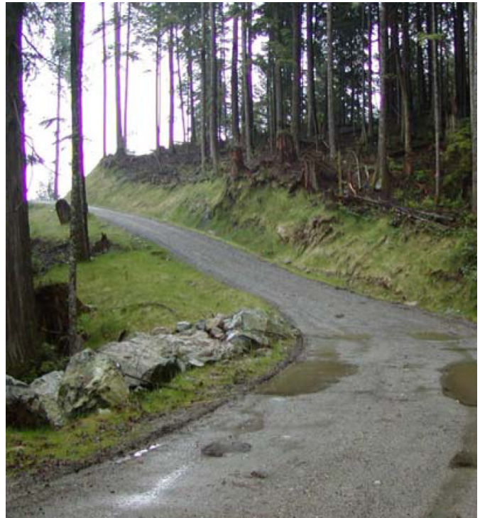
Figure 3. This resource road approaching a stream crossing has incorporated many attributes required to minimize water quality impacts. The cut banks and fill slope are well vegetated, a culvert and ditchblock are strategically located to remove inside ditch water and allow sufficient forest floor to reabsorb the water, a swale is located before the bridge, and the bridge deck itself (from which the photo was taken) built above road grade.

The potential for range impacts was noted at between 38 to 90% of the sites evaluated, depending on year of sampling. In other words, a drinking water intake where livestock were noted upstream had a good chance of being impacted by fecal contamination. These potential impacts most frequently occurred where livestock had direct access to the stream.