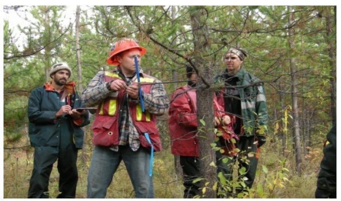
Field crews in Central Cariboo learning how to conduct Stand Development Monitoring (SDM) in post free-growing stands.