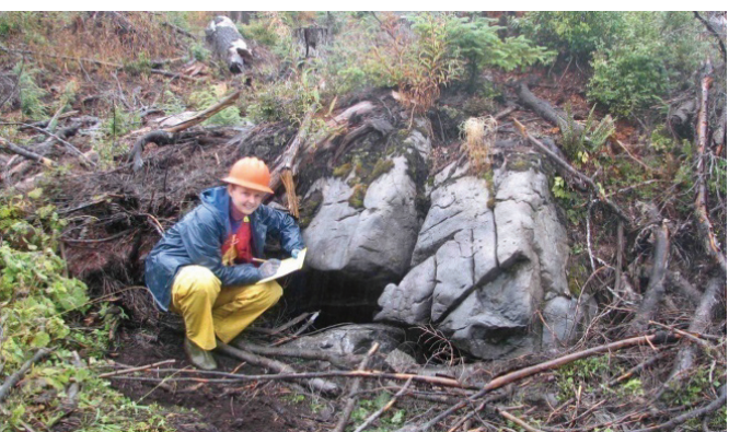
Assessment of a karst resource feature on Northern Vancouver Island