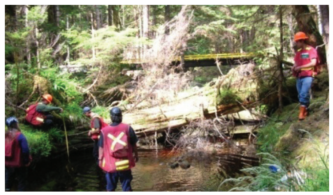
Collaborative FREP-Haida Fish/Riparian monitoring training on Haida Gwaii