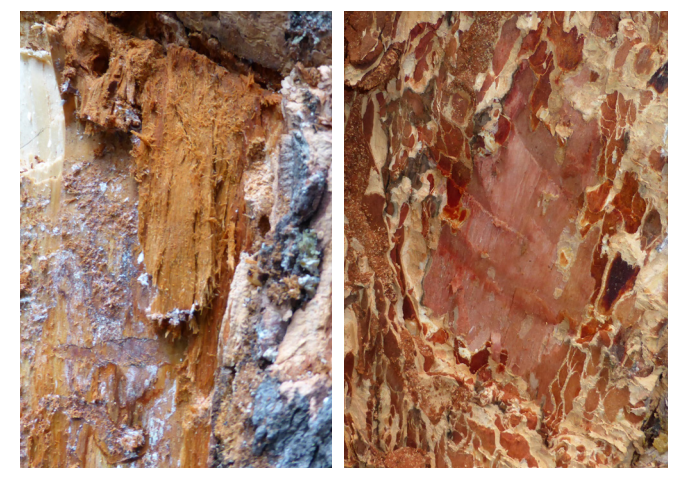
Figure 8: Brown cambium on a tree that has been attacked (left) and pink cambium on a healthy tree (right)