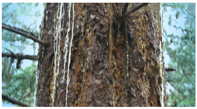
Figure 5: Sap streaming on the mid-bole or upper-bole of a Douglas-fir tree that has been attacked