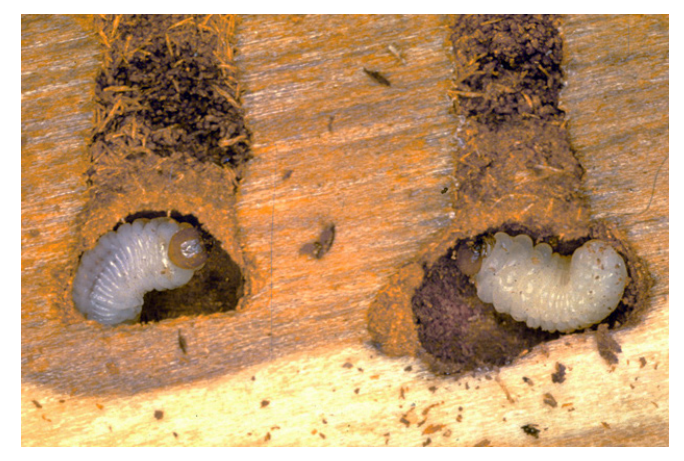
Figure 2: Douglas-fir beetle larvae

The female will lay about 50 eggs in small groups on alternate sides of the gallery. The eggs hatch into larvae, which mine horizontally out from the main gallery (Figure 2). At the end of each larval tunnel, larvae construct a chamber where they pupate and become adults. The brood overwinters as larvae or immature adults, and mature adults emerge in the spring to attack new host trees.