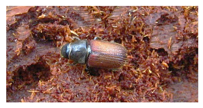
Figure 1: Adult Douglas-fir beetles are dark brown and black, and are 4.5 mm to 7 mm long.

Adult Douglas-fir beetles are robust, cylindrical insects that range in length from 4.4 mm to 7.0 mm (Figure 1). They are dark brown to black in colour, with black heads and red wing covers.