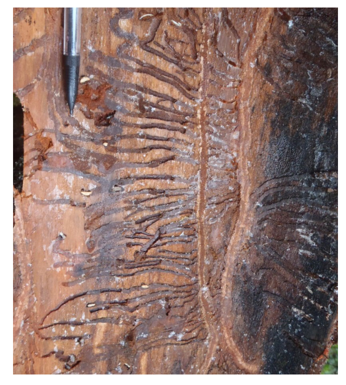
Figure 7: Douglas-fir beetle gallery under the bark, with visible larvae

» Beetle galleries (the shallow tunnels that beetles create while feeding) are etched into the underside of the bark (Figure 7).