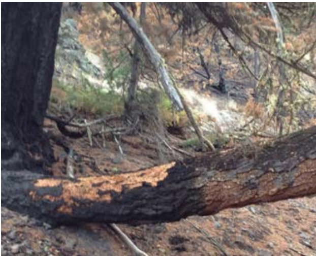
Figure 6: Damage caused by a woodpecker feeding on beetles on a fire-damaged Douglas-fir tree.