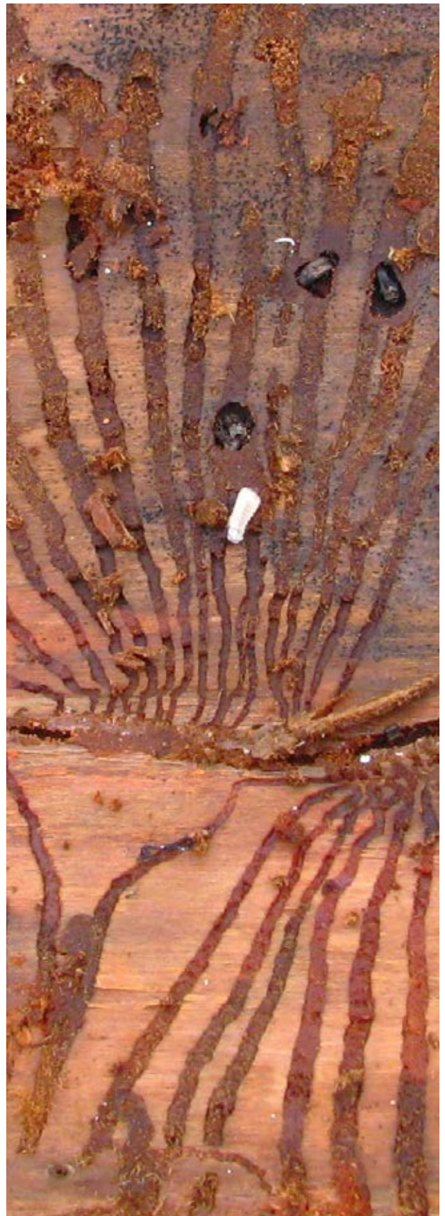
Figure 8: Douglas-fir beetle "galleries" under the bark, indicating that the tree is infested and should be removed from the property to minimize the beetles' spread the following year.