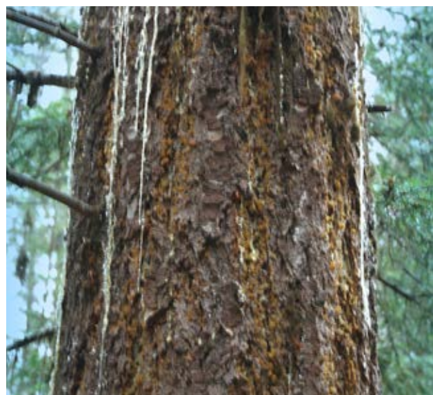
Figure 5: Sap streamers on the upper portion of a tree (sap streamers lower on a tree trunk or tree limb may have been triggered by another type of injury).