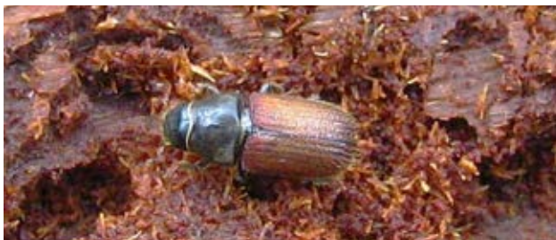
Figure 1: Adult Douglas-fir beetles are dark brown and black and are 4.5 mm to 7 mm long.

https://www.for.gov.bc.ca/hfd/library/documents/treebook/douglasfir.htm