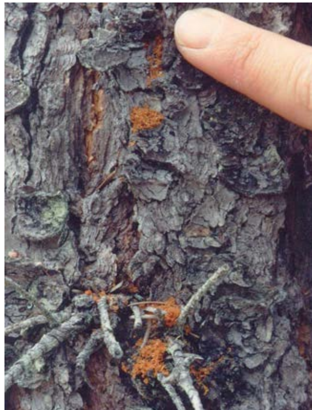
Figure 4: Frass (fine sawdust) on a tree trunk, an indication that beetles have bored into the tree.