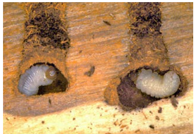
Figure 2: Douglas-fir beetle larvae.