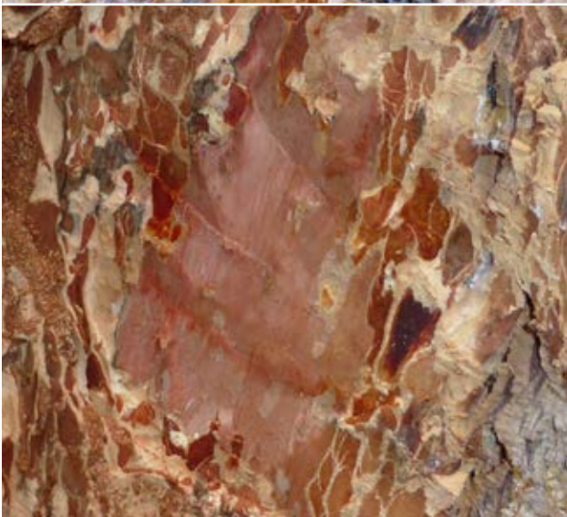
Figure 7: Brown cambium on a tree that's been attacked (which will die even if the crown is still green) and pink cambium on a healthy tree.