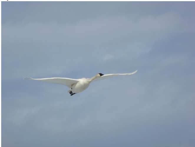
Trumpeter Swan

A BCTS review of the updated Migratory Birds Regulations (for Northern BC) further protects the nests of Pileated Woodpeckers all times of the year , regardless of it being occupied.