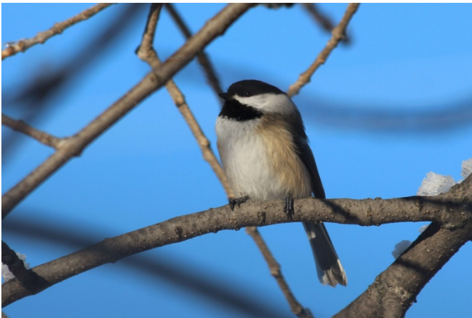
Black-capped Chickadee