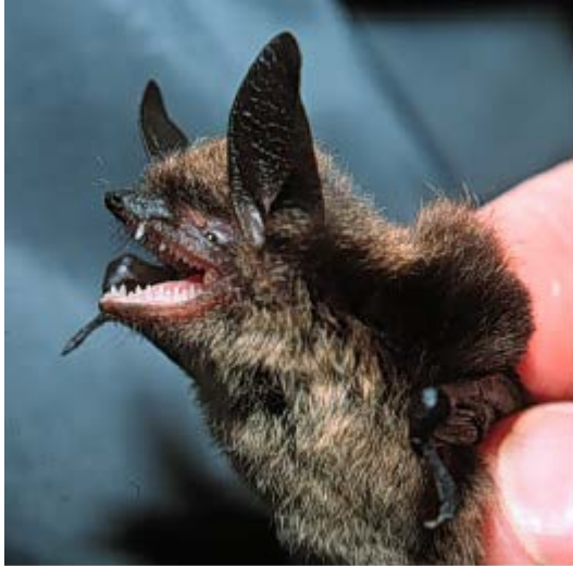
Keen's Long-eared Myotis