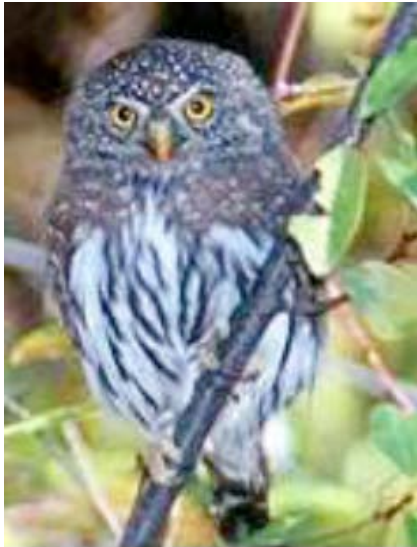
Vancouver Island Northern Pygmy Owl