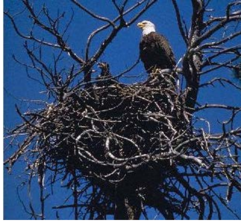
Bald Eagle Nest