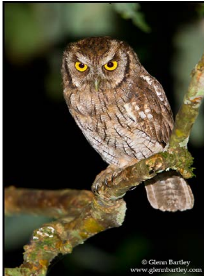
Western Screech Owl