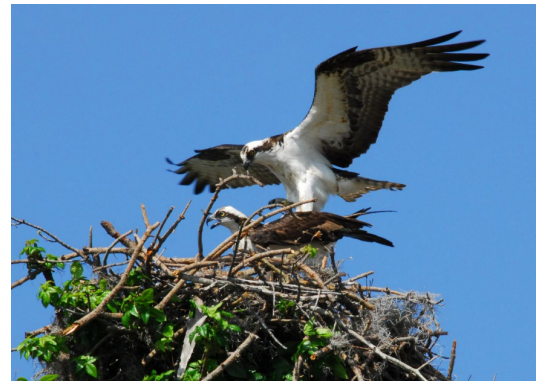
Osprey Nest (Wildlife Act)

Golden Eagle tree nests look similar, or nests can be constructed on cliff ledges