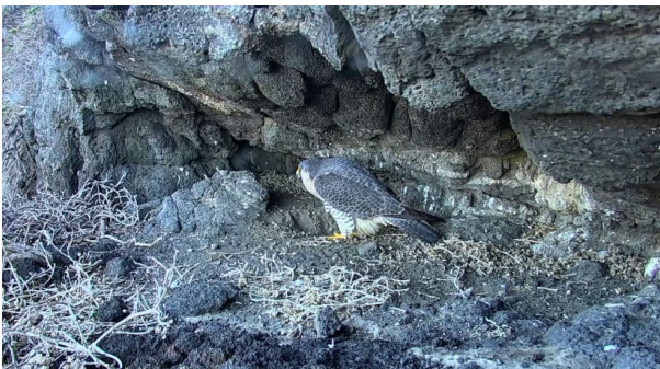
Peregrine Falcon Nest (Wildlife Act)