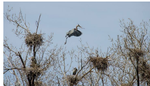
Great Blue Heron Nests (Wildlife Act, Schedule 1 MBR)