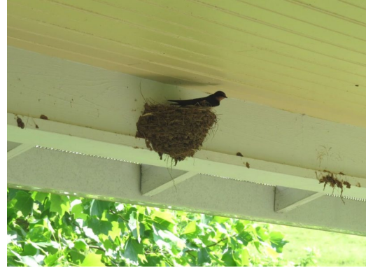
Barn Swallow Nest (SARA)