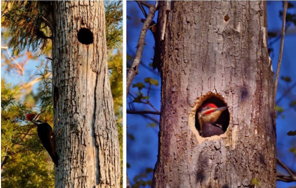
Pileated Woodpecker Cavities (Schedule 1 MBR)

The inactive nests of these species have regulatory protection.