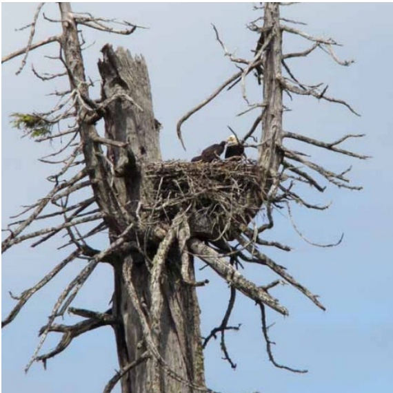
Bald Eagle Nest (Wildlife Act)

Golden Eagle tree nests look similar, or nests can be constructed on cliff ledges