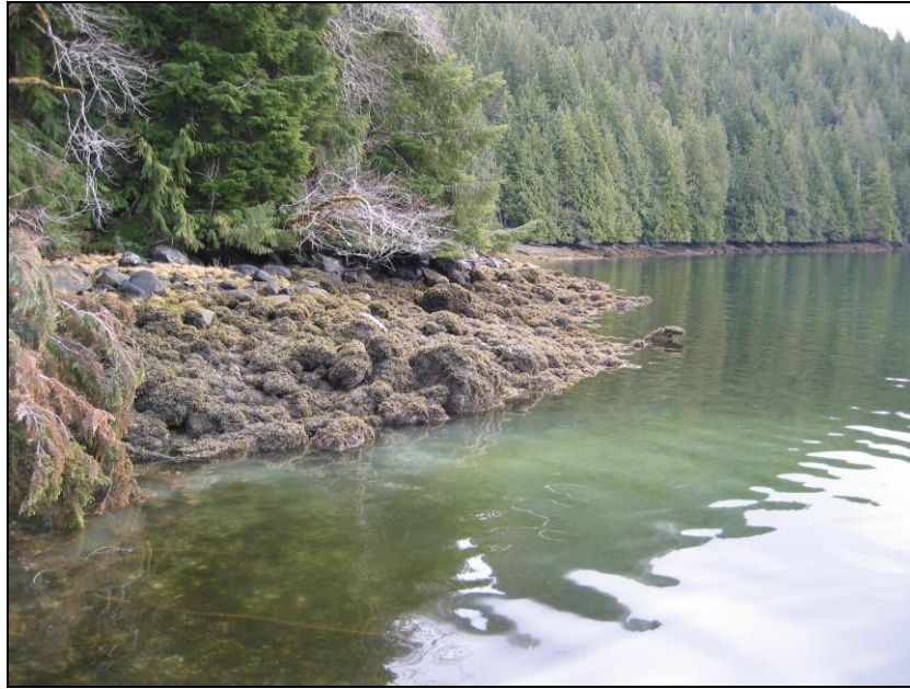
Photo 2: Herring spawn in shallow estuary area as shown by the milky spawn in water and eggs deposited on intertidal algae.

spawn is deposited within 10m of the mean tide level, and >90% occurs within 150m of the inshore edge of spawning. Eggs are deposited on surfaces of vegetation in 1 – 5 layers on average, with a maximum of 20 layers found (Photo 3). Once deposited, the eggs take about 14 days to hatch in areas in the South Coast, and closer to 21 days in the north, depending on water temperatures (DFO Herring Spawn Survey Manual, 2009).