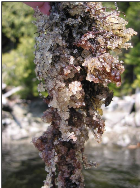
Photo 3: Close up view of herring eggs deposited on intertidal vegetation.