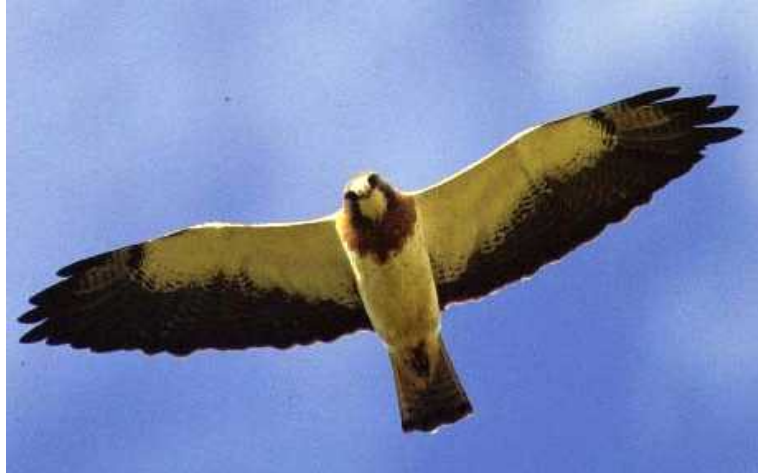
Light Morph Swainson's Hawk.