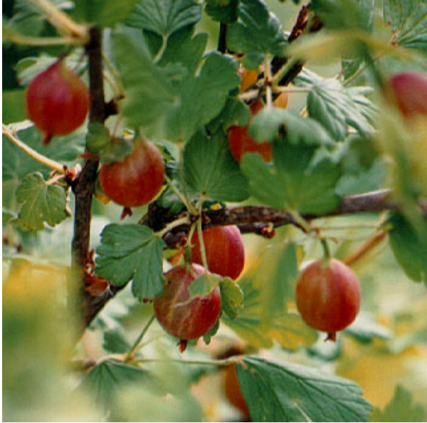
Northern gooseberry.