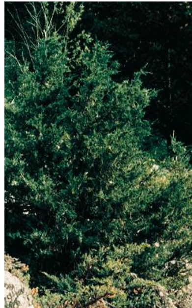
Rocky Mountain Juniper