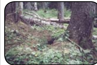
◀ Mountain Beaver burrows and runways along the gully wall of a small stream.