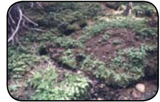
▲ Mountain Beaver burrow under Engelmann spruce tree showing "haypile" at entrance.