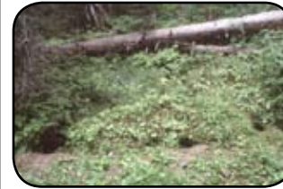
▲ Mountain Beaver burrows and runways.