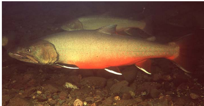
Male (left) and Female (below) Bull Trout during spawning.