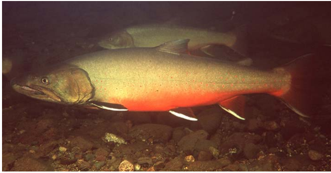
Male (left) and Female (below) Bull Trout during spawning.