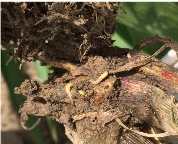
Western Corn Rootworm larvae in corn roots (July): brace roots completely destroyed

Adults: Very active 6 mm long yellow and black beetle. Females have 3 black longitudinal stripes, and their yellow abdomens protrude beyond their wing covers (elytra). The males' stripes coalesce and appear more like a black patch.