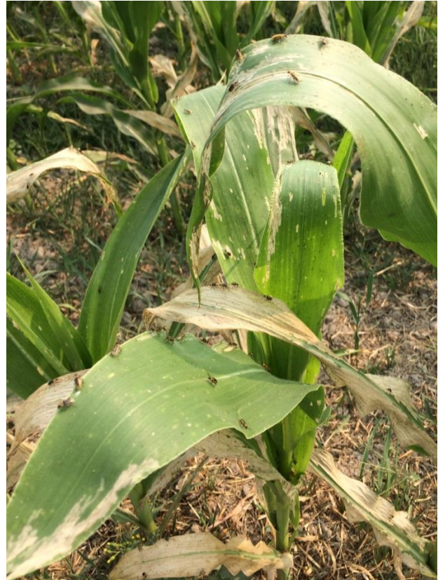
Severe feeding damage on corn leaves from adult beetle feeding