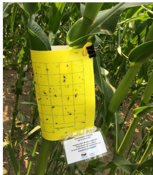
Yellow sticky trap used for monitoring Western Corn Rootworm beetles in corn

Adult beetles can be monitored for in July-August, and it useful to determine if the insect is present in a field and if management efforts should be taken either in the current year or in the next year. Visually scout for beetles, either with yellow sticky cards attached to corn plants checked once per week, or field scouting. If scouting fields, check 20-60 plants per field, walk along the field edges and into the field and record if you see any beetles or damage. Alternatively, spend a certain amount of time per field looking (i.e. 10 minutes per field). Carefully check ears and leaf axils for beetles. Beetles are easily disturbed and will fly or drop quickly. Beetles are especially active during warm evenings.