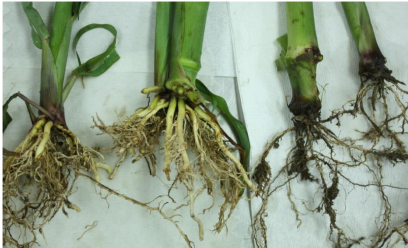
Severe rootworm larvae damage to roots on the 2 plants on the right. Brace roots are destroyed from feeding larvae

activity is in late July to mid August, though beetles can be found as late as early October. There is one generation per year.