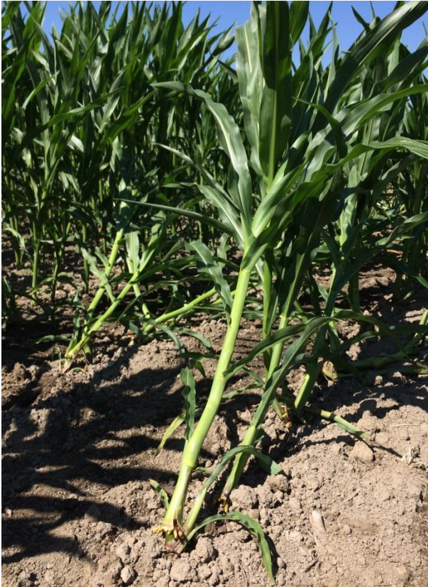
Lodging, tipping over, instability or 'goose necking' are signs of rootworm larval feeding

Adult beetles feed on corn foliage and silks of developing corn ears which can negatively affect pollination and fill of the cobs as well as be a contaminant at harvest for the fresh market sweet corn. Adults are pollen feeders and will damage late summer flowers and foliage of squash, dahlia, as well as feed on weeds such as redroot pigweeds. Rootworm larvae are the most damaging stage to corn, as they feed on roots, compromising plant growth and stability, resulting in tipping plants, lodging, and poor yields in both sweet and forage corn. Plants may not lodge or tip over but may look weak and drought-stricken.