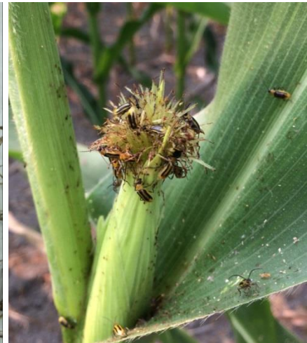
Western Corn Rootworm beetles snipping off corn silks