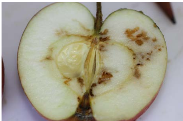
Internal feeding damage by apple maggot.

Please contact the CFIA at (604) 557-4500 if you plan to move any host fruit, host trees with soil, or host nursery stock, out of the Lower Mainland, Vancouver Island or Prince George areas.