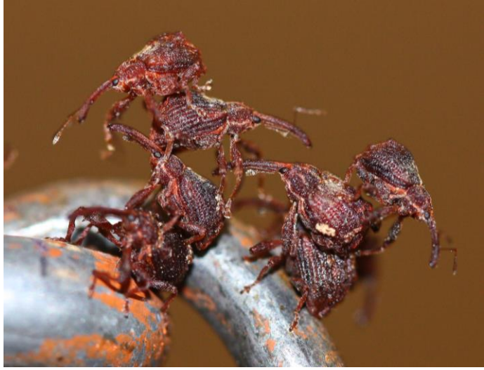
Figure 4. Apple curculio adults