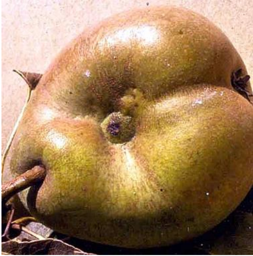
Figure 3. Pear fruit damaged by adult apple curculio feeding