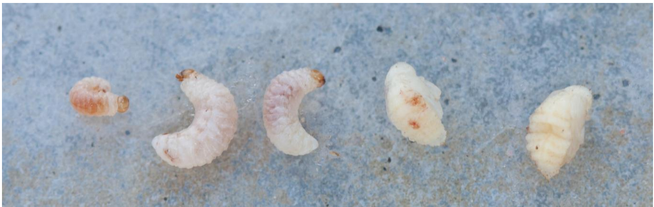
Figure 5. Apple curculio larvae (left) and pupae (right)

Chemical - No registered chemical control; however, contact insecticides applied during early petal-fall of pear will control apple curculio.