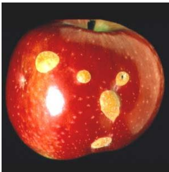
Figure 1. Raised russeted areas on maturing fruit caused by early season feeding

Adult - Small (about 5 mm long); reddish-brown weevils with long narrow snout and four small humps on their backs (Figure 4). They are good fliers and will drop and play dead when disturbed.