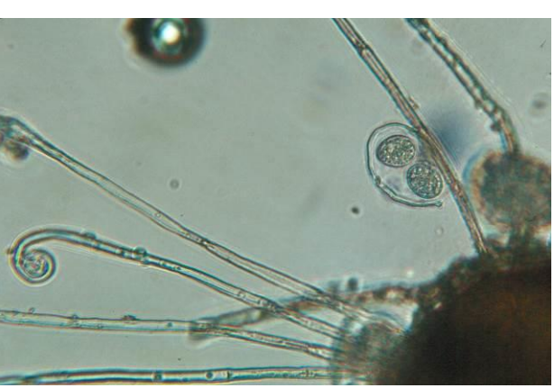
Powdery mildew chasmothecia on grape shoot.