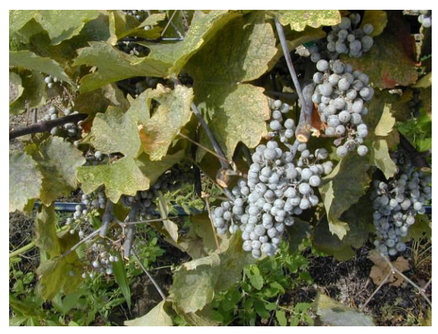
Powdery mildew on Reisling grape.