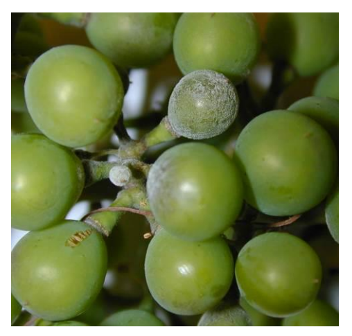
Early powdery mildew symptoms on Chancellor grapes.