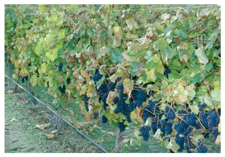
Vines severely affected with powdery mildew.

Early powdery mildew infections can cause reduced berry size and reduced sugar content. Scarring and cracking of berries may be so severe as to make fruit unsuitable for any purpose. Winemakers have a very low tolerance for powdery mildew on grapes. Research has shown that infection levels as low as 3% can taint the wine and give off-flavours.