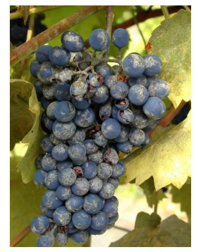
Severe powdery mildew on Chancellor grape cluster.