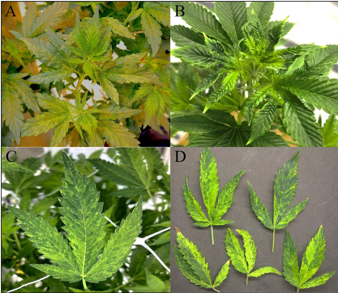
Figure 6: Symptoms of virus and viroid infection. (A) Young leaves are light green with alternating patterns of yellow. (B) Malformed leaves caused by Hop Latent Viroid on a plant growing vegetatively. (C, D) Older leaves with yellow and green striking pattern of mosaic.