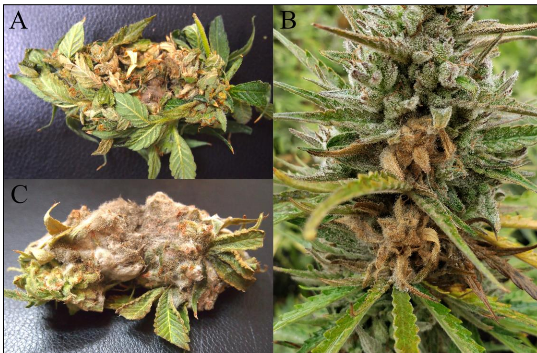
Figure 4: Cannabis (inflorescences) affected by Botrytis . (A) An infected bud, with visible grey mycelium. (B) A dense flower affected by bud rot, with distinct discoloured necrotic tissues. (C) Severe infection on a cannabis flower showing abundant spores.

Buds (inflorescences) affected by Botrytis initially appear soft and discoloured. As symptoms progress, buds may turn crisp and brown (Fig. 4A). Infections commonly start in the interior of the buds, where humidity is highest and air movement is lowest, and progress outwards (Fig. 4B). Grey or off-white mycelial growth may also be observed on affected buds. Under high humidity, the pathogen will sporulate and produce characteristic grey mould (Fig. 4C). Stem cankers appear as slightly sunken tan or off-white areas on the main stem or at branching points where an injury has occurred. Grey sporulation is also often observed on the cankers. Most infections take place during the early fall and winter seasons, and only rarely during the warm summer months. The pathogen does not grow at temperatures over 30°C but can grow at 5-10°C.