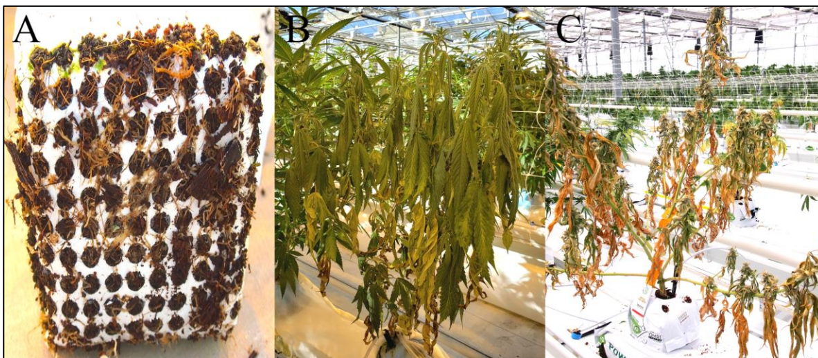
Figure 2: Symptoms of Pythium infection on cannabis plants. (A) Brown necrotic roots. (B) A stunted, wilting plant in flower, where infected plants may remain green although their roots are significantly damaged. (C) Death of a plant.

Pythium causes roots to appear brown, rotten and with a distinct lack of feeder roots (Fig. 2). The outer region of infected roots may easily slough off, leaving only the vascular tissue intact. Symptoms of crown rot appear as dark, sunken lesions at the base of plants which can extend several centimeters up on the stems. Infected plants are often stunted, and leaves may later turn yellow. Wilting occurs rapidly under warm and sunny conditions. Diseased plants may emit an odor due to secondary invasion by bacteria, especially during warm weather.