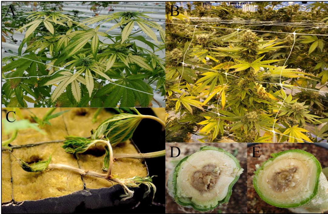
Figure 1: Symptoms of Fusarium diseases on cannabis plants. (A, B) Severe chlorosis and stunting of cannabis plants. (C) Damping-off on cuttings. White mycelium of Fusarium is visible on the stems. (D, E) Cross sections of cannabis stems showing discoloured and necrotic pith and xylem tissues.