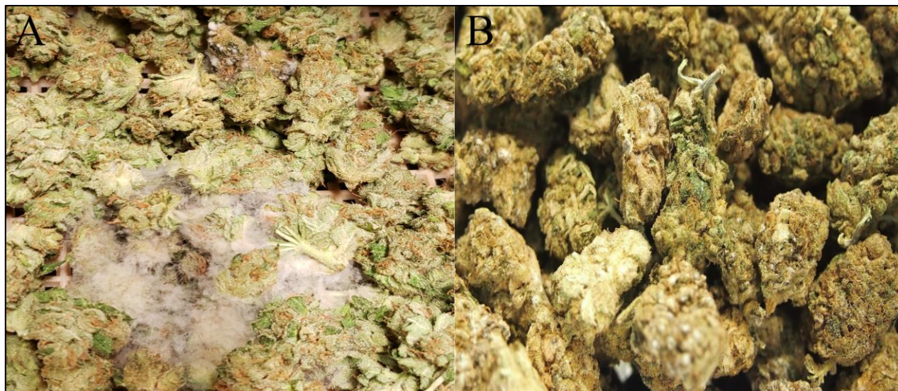
Figure 5: Post-harvest decay of harvested cannabis buds. (A) A large patch of Botrytis mycelium on buds as well as a bud affected by Penicillium above it. Discoloration and white mycelium can be observed. (B) Penicillium and other fungal species growing on harvested buds. Small patches of white mycelium are visible on buds.

Affected buds appear soft and discolored. Aerial masses or small spots of white, grey, or off-white mycelium are usually visible on affected tissues, typically 2-5 days after harvest. On dried buds, darkened areas with fungal spores can be seen.