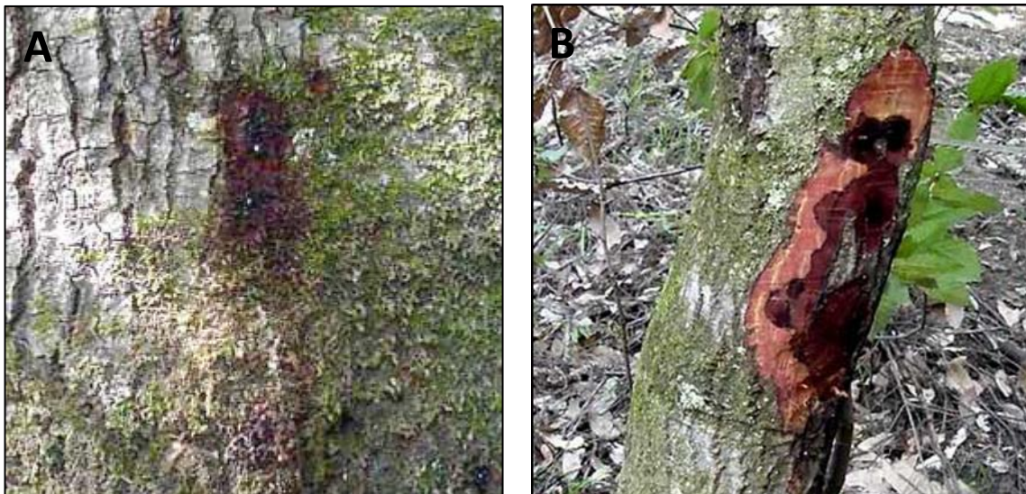
Figure 2. Bleeding canker on coast live oak ( Quercus agrifolia ) (A) and sudden oak death canker showing clear zone line on inner bark of tan oak ( Lithocarpus densiflorus ) (B), caused by P. ramorum .