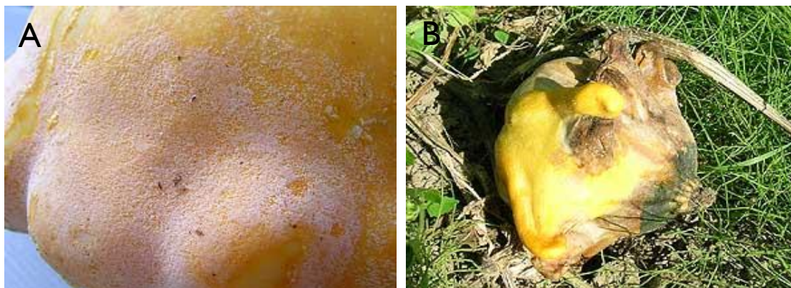
Figure 2. Gourd fruit covered with white cottony growth (A) and a mummified fruit (B), infected with Phytophthora capsici .