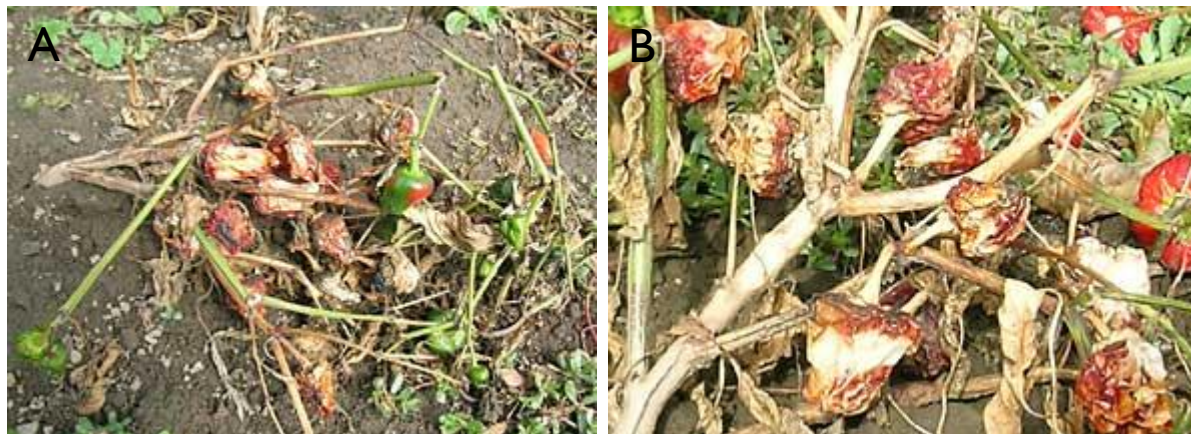
Figure 2. Pepper plants killed by phytophthora blight.

On pepper, infection of the stem near the soil line is common. Stem lesions start as dark, water-soaked areas which become brown to black and result in girdling, wilting and plant death. Phytophthora capsici may also cause root rot and foliar blight on pepper. On leaves, small, water-soaked lesions expand and turn a light tan colour. White moldy growth may be seen on leaves during wet periods. Rapid blighting of leaves and shoots may occur. Pepper fruit can also be infected through the fruit stalk. Fruit rot appears as dark green, water-soaked areas that become covered with a white to gray mold. Infected fruit dries, shrunken and wrinkled and remains attached to the stem.