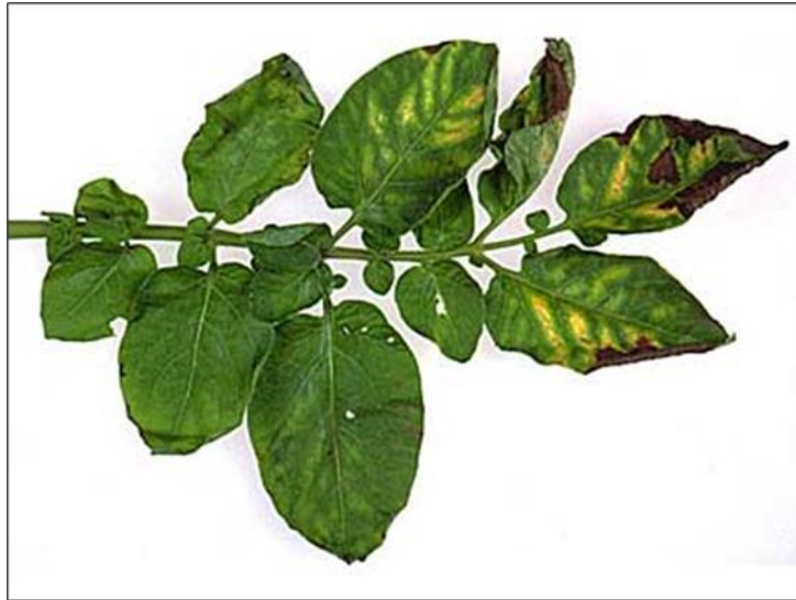
Figure 2. Symptoms on potato leaf infected with bacterial ring rot.