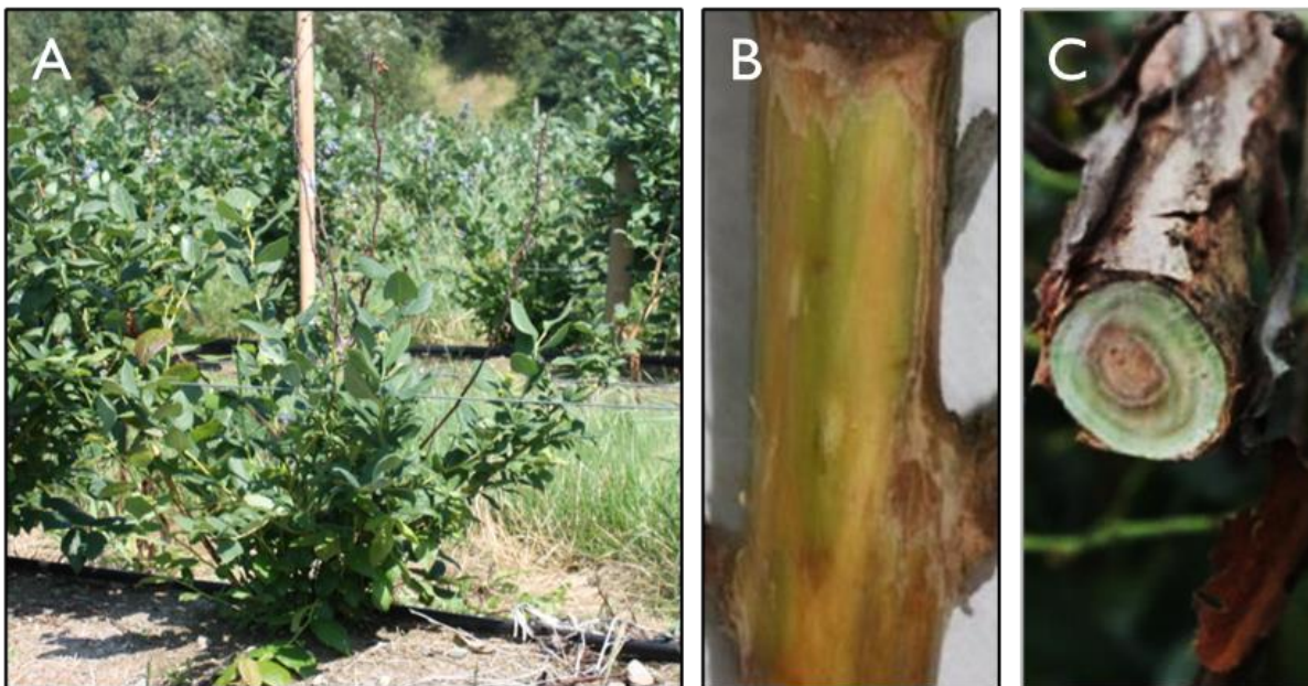
Figure 3. Dieback and 'flagging' of stems (A), discolouration (mottling) of stem tissues beneath the bark (B) and browning of pith tissue (right) of cultivar 'Draper' infected with Phomopsis vaccinii .