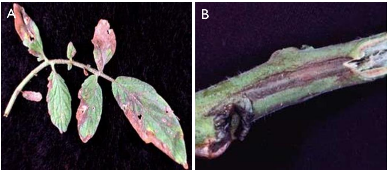
Figure 1. Necrosis on the margins of tomato leaf (A) and brown canker lesion and vascular discoloration on a tomato stem (B) infected with Clavibacter michiganensis pv. michiganensis .