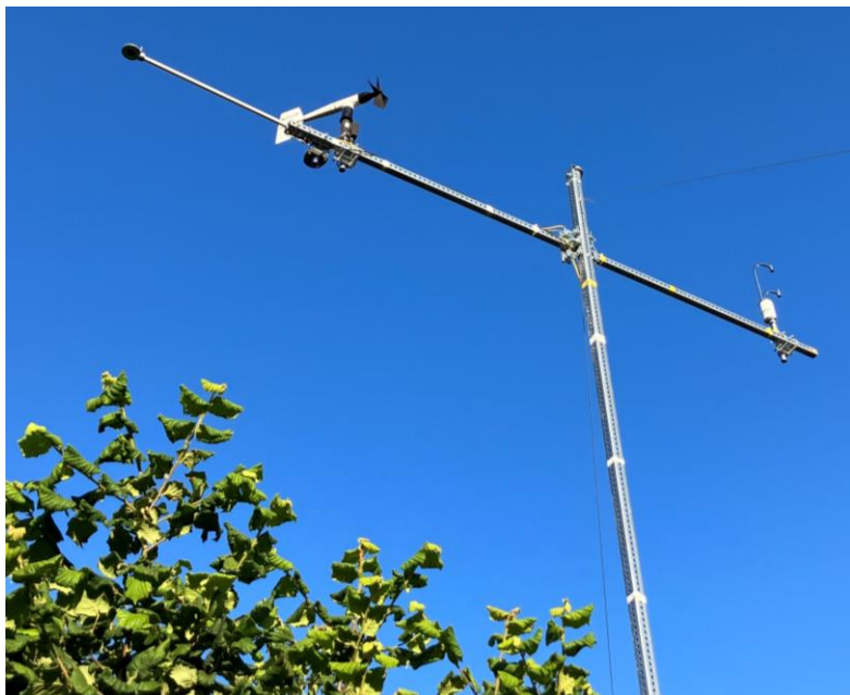
Figure: Tower to measure ET in an hazelnut orchard (Van Maren Farms, Chilliwack)

Future outlook: Combine direct tree measurements of \Delta SWP with orchard monitoring of evapotranspiration (ET) to schedule irrigation events and develop sustainable irrigation practices.