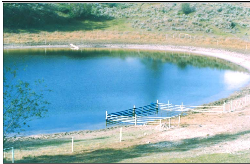
Restricted Livestock Access To A Pond

Unrestricted Access. This option may have the greatest risk of pollution unless carefully matched to the livestock use. Evaluate such access with the characteristics of the site and degree of expected livestock activity in mind. This type of access is commonly used on sites of low density grazing, such as on dryland pastures. It may not be appropriate for high-use sites, such as summer-long grazing on irrigated pastures.