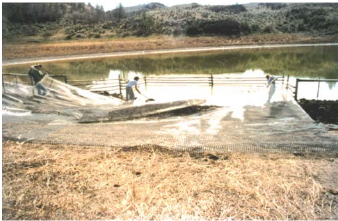
Geogrid is pulled into place