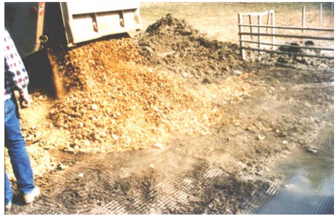
Gravel is placed directly onto the Geogrid