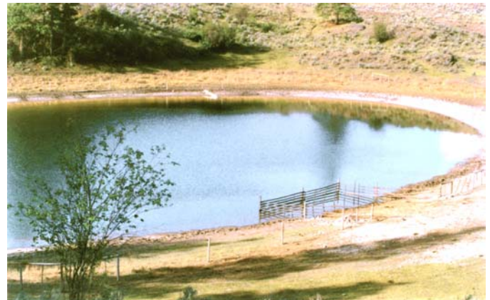
Figure 1 Turtle Lake - Habitat Protection Site

Material costs of the geogrid should be paid back in reduced gravel costs and improved access to the water. Roads, feed lot areas etc. can be treated in the same manner.