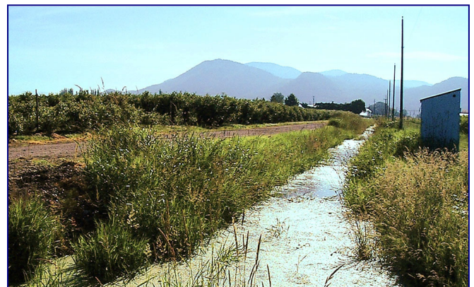
Figure 1 Agricultural Drainage Ditch

The parameters to test for depend on the likely source of contamination as shown below: