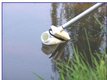
Figure 3 Water Sampling with Bottle

The Riparian Management Field Workbook provides additional information on filter strips, cropping strips and buffers.